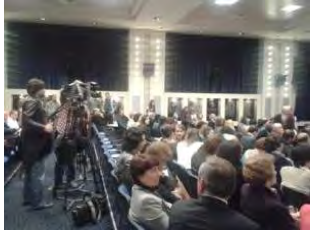
UPF event being filmed in Tirana