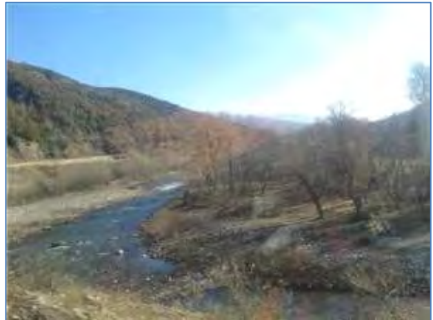
Saying goodbye to Albania – Way back via Macedonia-Serbia-Hungary-Austria-Finland