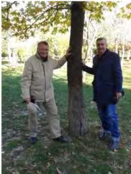
5 Dec we created the first Holy Ground in Elbasan