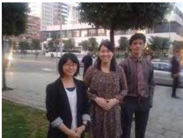
Members welcoming guests to the UPF event

That coming weekend was a big event for UPF in Tirana. I was welcomed to take part which was held in a rented hall full of VIP:s and some members. The Albanian TV was there filming the event for the evening News.