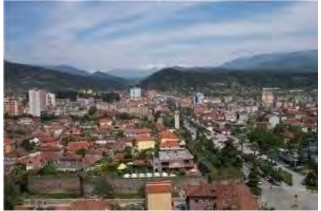
The City of Elbasan with snowy mountains at far away