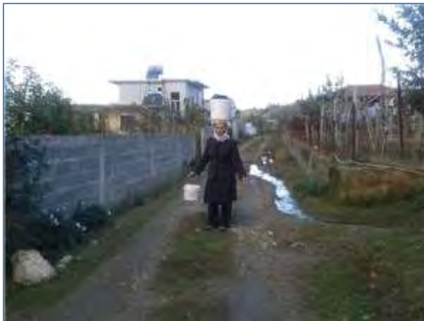
Country people, very friendly. We got 3-4 kg oranges, and people often invited us into their homes