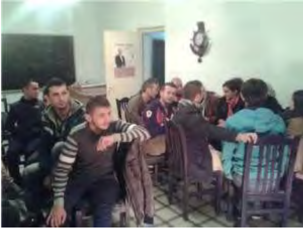
Every Thursday 4PM CARP meeting, Lecture and then a Game