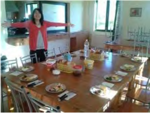
Sister from the Japanese team welcoming us to breakfast at Mullet Training Center