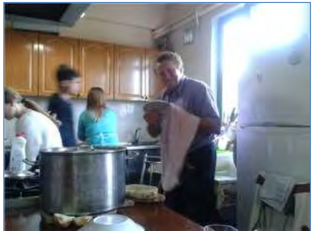
Doing the dishes