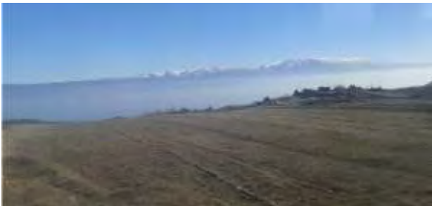
Final view of Albanian beauty – border with Macedonia