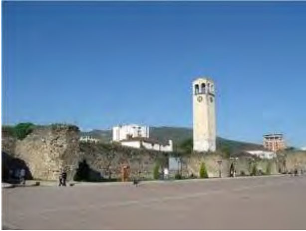
Elbasan Castle. The only field castle in Albania