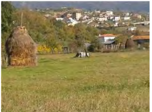
Nature outside Mullet Training Center