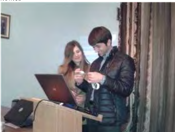
25 year Birthday – Ajet Center Leader