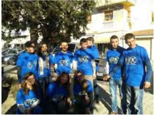
Together with UPF in Elbasan we planted trees in a park. The City Mayor was there and Albanian National News TV covered the event.