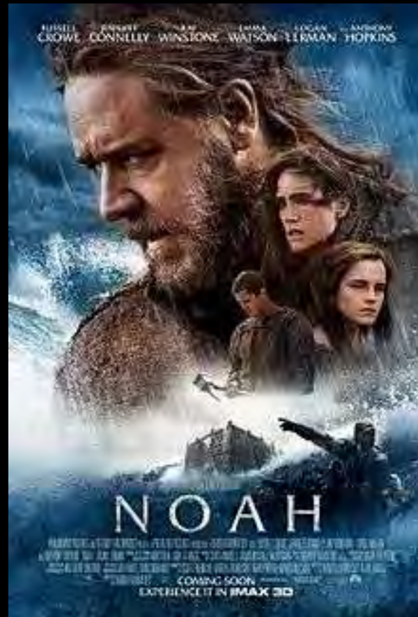
Noah (Film 2014)