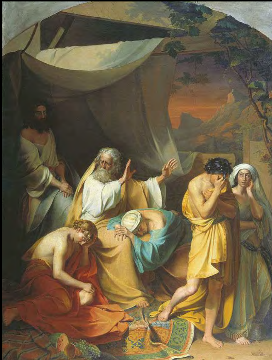
Noah damning Ham, 19th-century painting by Ivan Stepanovitch Ksenofontov