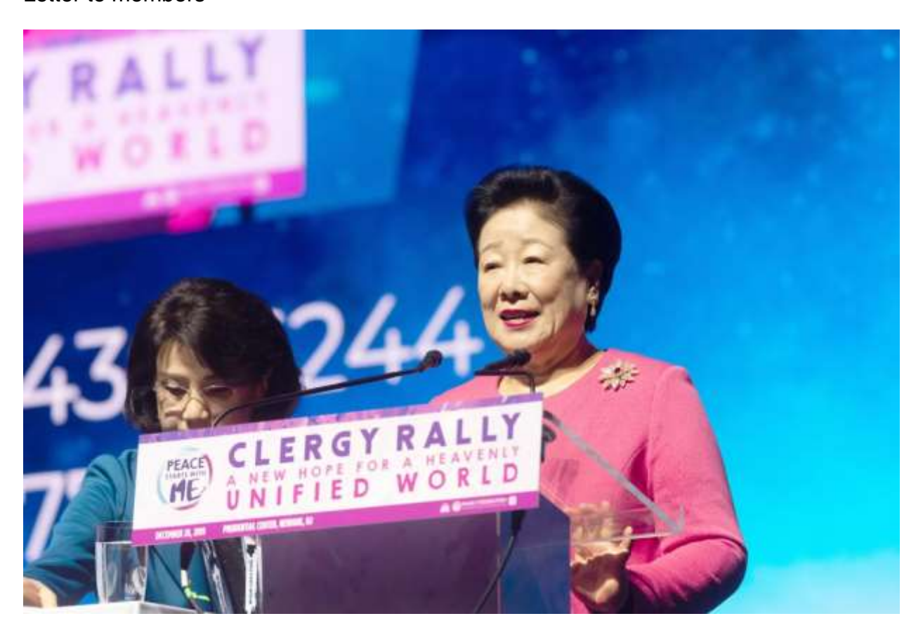
The unstoppable tears on our course for a heavenly nation, heavenly continent, and heavenly unified world

Young Ho Yoon December 28, 2019 Letter to members