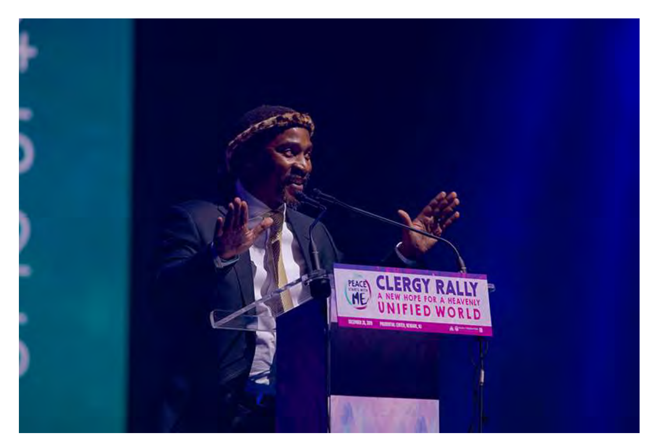
One plus one plus one equals three (1 + 1 + 1 = 3). Motherland, Mother Earth, Mother of Peace.

Life begins in the mother's womb. That is why the earth is regarded as "Mother Earth." (It is actually a sum I am doing now: One plus one plus one equals three.) Africa is regarded as the Motherland because it is where life is said to have begun. (Number 2) And Mother Moon, the True Mother, is regarded as the Mother of Peace because she has lived her entire life for the sake of peace and to give new life to humanity through the Blessing. In the case of Africa, we are trying to connect the Universal Mother of Peace with the Motherland so that we can bring peace to the Mother Earth.