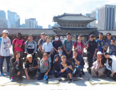
景福宮 Gyeongbokgung Palace