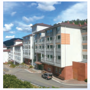
鮮鶴韓国語学院/鮮鶴留学生寄宿舎 Sunhak Institute & Dormitory

予備課程と中高等学校に進学中の祝 福子女留学生たちは毎年、真の御父 母様がくださる孝情奨学金を受け います。