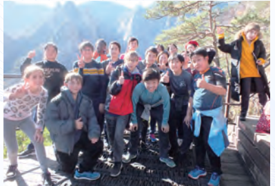
雪岳山 Mt. Sorak