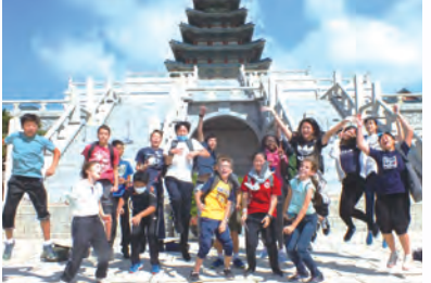
國立民俗博物館 National Folk Museum of Korea