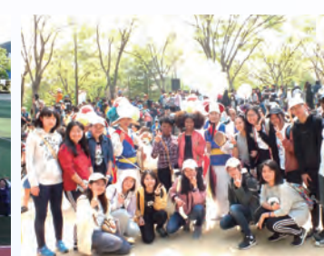
韓國民俗村 Korean Folk Village