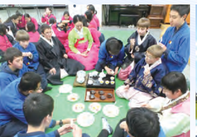
伝統茶道体験 Traditional Tea Ceremony