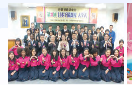
日本予備生入学式 Japanese students-Entrance