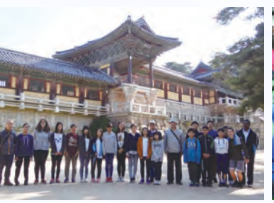
慶州-佛國寺 Gyeongju-Bulguksa Temple