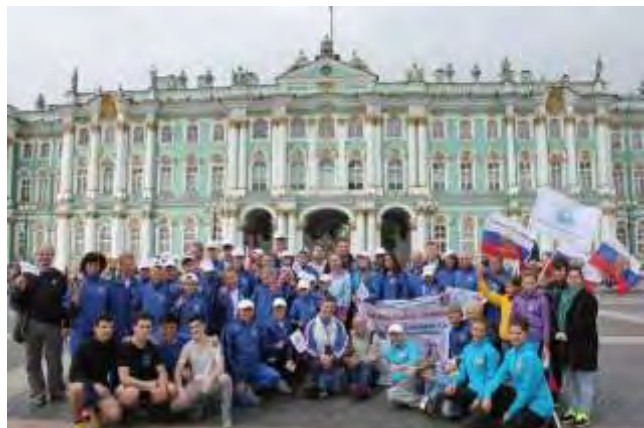
Russia, Europe (June – Aug. 2017) Russia held total of three Peace Road projects. In the 1 st project participants completed the 800 km marathon relay. The second project was held on the Day of International Friendship in three nations such as Ukraine and Belarus. In the last project participants cycled in the Ryazan city central park and held commemorative concert in front of the many local citizens, bringing the Peace Road to a successful end.