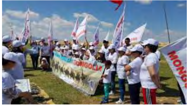
Mongol, Asia (Aug. 12, 2017) : In the Mongol Peace Road, participants rode camels across the Gobi desert. Mongol Peace won the “This year’s Peace Road” prize for its unique style effectively utilizing the regional culture.