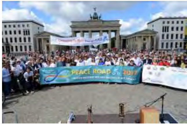
France, Europe (Aug. 4, 2017) : France added much value to its Peace Road by holding peace event in Verdun, Germany where nearly 300,000 lives were lost during the World War I. The Peace Road team also visited Brandenburger Tor which symbolizes the friendship between France and Germany to reflect and remember the war torn history.