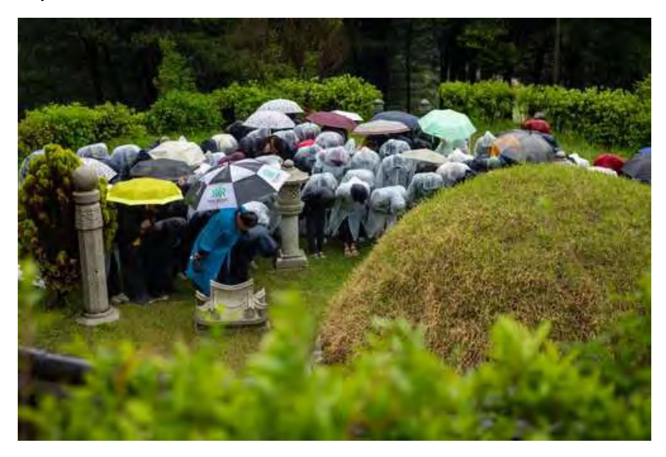
Early in the morning, small drops of rain began to fall from the sky as it gradually became heavier with a faster tempo as it hit the ground.

But despite the gloomy color in the sky, it was the perfect chance to go back to True Mother's words, "I have grown to accept rain at such times with gratitude, as a gift." And today's gift was being able to set off for the first day of our pilgrimage!