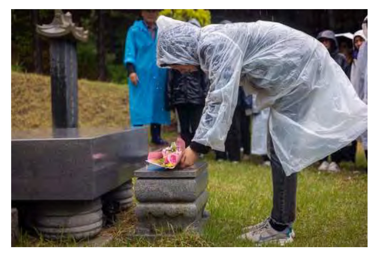
Our first stop was the Paju Won Jeon, the graveyard for True Family, 36 Blessed Couples, and members who offered great devotion and jeongseong for True Parents.

But despite the gloomy color in the sky, it was the perfect chance to go back to True Mother's words, "I have grown to accept rain at such times with gratitude, as a gift." And today's gift was being able to set off for the first day of our pilgrimage!