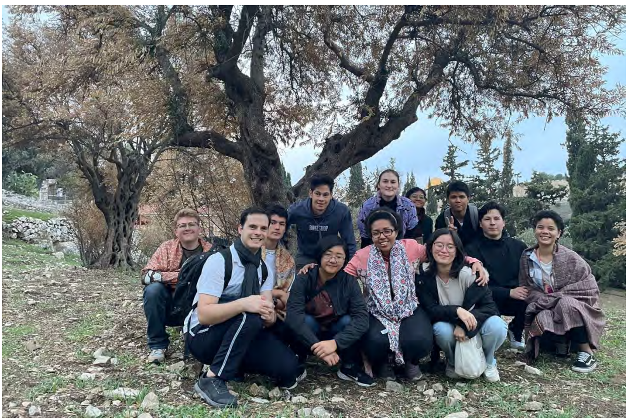
Holy Ground in Gethsemane, Jerusalem

Through witnessing, Jerusalem's city streets have become one of our most beloved places!