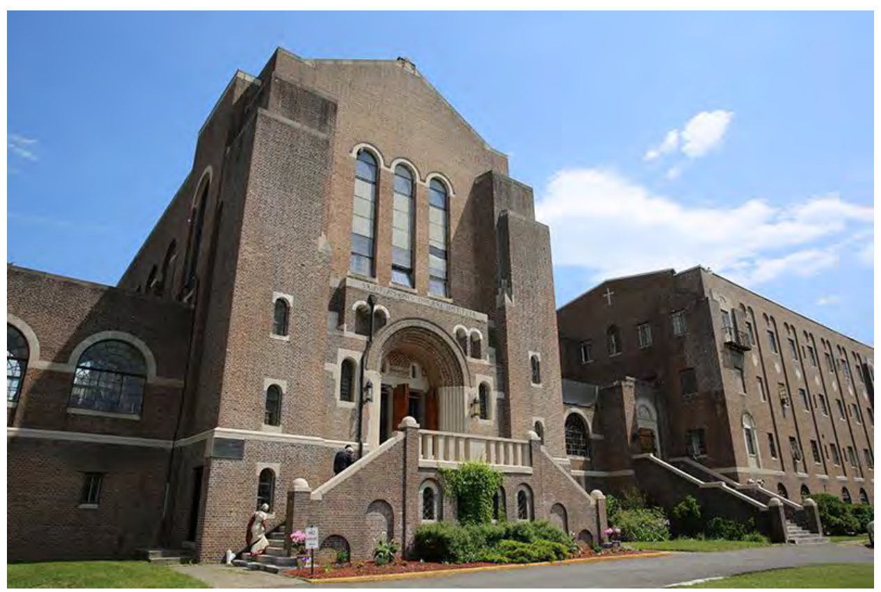
Unification Theological Seminary in Barrytown, NY

Forty-six years ago today, on September 20, 1975, the Unification Theological Seminary (UTS) opened its doors in Barrytown, New York, to the first class of 56 students, who enrolled in a two-year religious education program.