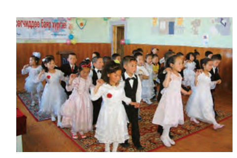
A folk dance was performed at the graduation ceremony