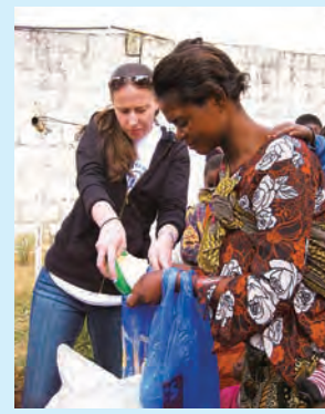
Delivering soy flou