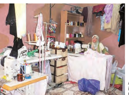
woman who succeeded n financial independence

A woman with nine children received a loan in 2002. In the beginning she was operating a tailoring business all alone with her domestic sewing machine and not making much money. Her husband had liver disease and couldn't work. The family struggled to make ends meet. She purchased an industrial sewing machine with a loan from WFWP's Microcredit project. Suddenly she began receiving orders from large wholesalers and her workload increased dramatically. She purchased more industrial sewing machines with an additional loan and could have three employees. Her husband passed away, but she is able to raise her 9 children on her own.