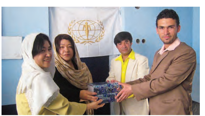
Opening ceremony of a library

New Developments: In 2008, the class had 26 students in total (18 in the novice course; 5 in beginners course I; 3 in beginners course II). 25 students completed the course. Because it is groundbreaking in the region for uneducated women to become literate even to the level of first grade in elementary school, many participants expressed their delight in reading independently. Senior students sometimes mentor junior students, helping those who cannot come to the regular gatherings.