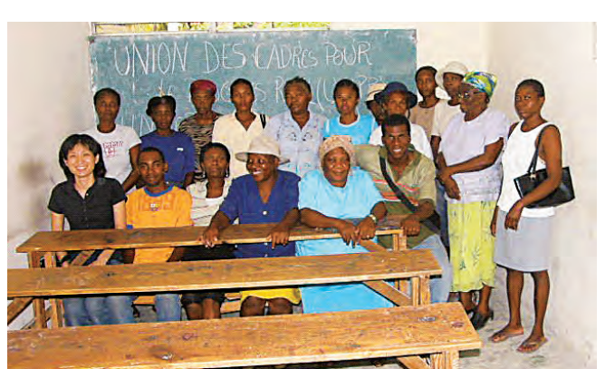
Students of Literacy Class

New Developments: In the Haitian capital city of Port au Prince, a nighttime six-month literacy course for adults was begun in May 2008. This literacy class provides a one-hour lesson every weekday evening at a classroom borrowed from a local college. Tuition is free. This class enrolled 75 students with an average age of 50 years old.