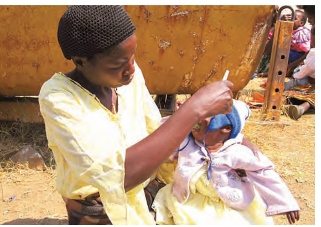
Mother is feeding porridge at a nutrition class

The number of graduates has rapidly decreased since 2007. This is because two of the clinics have neither roof nor enough space for the class so we are forced to conduct the class in the open air, risking exposure to bad weather. Rainy weather causes a decrease in the number of participants and hinders giving nutrition guidance with composure and prevents effective practice in making and feeding the porridge. As a result participants have a harder time understanding the instructions. Another reason for the decrease in participants; the local staff are so sympathetic toward the participants that they allowed many participants remain enrolled in the class so that they could keep getting a supply of soy flour, even though they could and