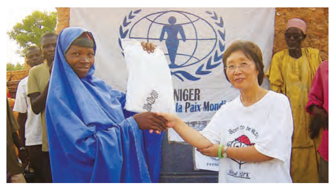
Donation of mosquito nets