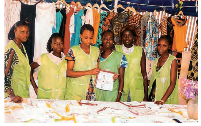
Students of Jamoo and their works displayed at the exhibition