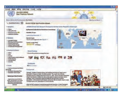
Website of UN-NGO-IRENE

URL:http://esango.un.org/irene/Index?page=viewPractice&nr=130