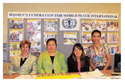
An exhibition booth of WFWP, International at UN Headquarters