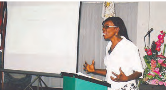
An active local lecture

(2008) In March, a seminar, introduced by the Secretary of UNDP, was given to 48 of St. Joseph public school teachers and students ages 11 and 12. In Diego Martin, a seminar was given to eighteen adults and young people interested in AIDS prevention. Among the participants, there was a girl who belonged to an Abstinence Club and maintained her conviction and purity. She was impressed