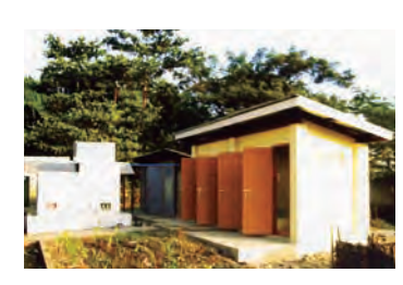
oilet constructed in hingun kyun

In 2008, 50 toothbrushes were donated to children of an orphanage in North Da Gon.