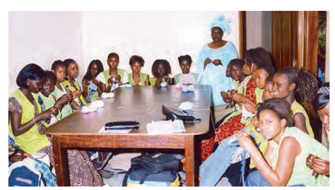
A class of knitting