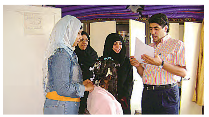
Examination of hairdressing course