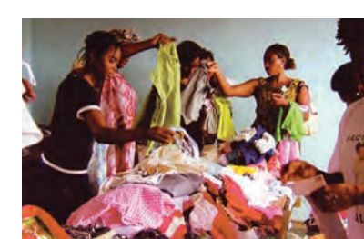
Goods from Japan are sold at the bazaars

The foster parents program supports children from poverty-stricken families.