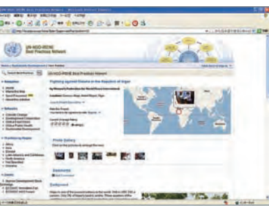
Website of UN-NGO-IRENE

In 2007, the Innovation Fair was initiated as a parallel event to the Annual Ministerial Review (AMR) during the first week of the Substantive Session of the Economic and Social Council (ECOSOC). UN NGOs were given the opportunity to introduce their success stories at this event. This is one of the precious opportunities for UN NGOs to interact with ECOSOC.