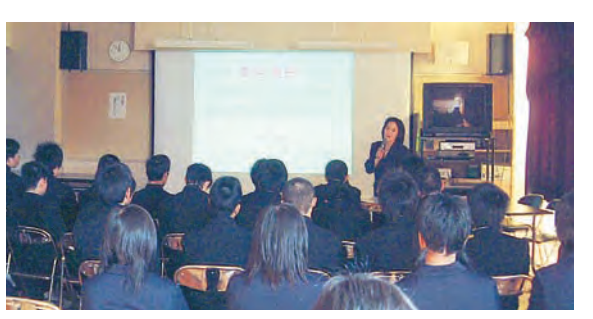
Seminar at a Japanese school

The abstinence message contains deep concepts that resonate in the conscience of young people so the message is well received. Consequently, teachers with good common sense and parents support the program.