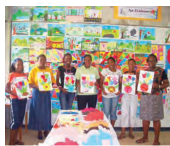
A class of art education