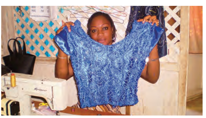
A trainee studying at a training shop