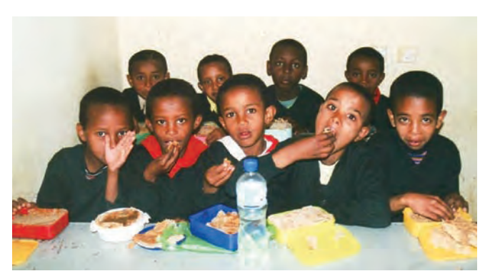
Happy lunch time