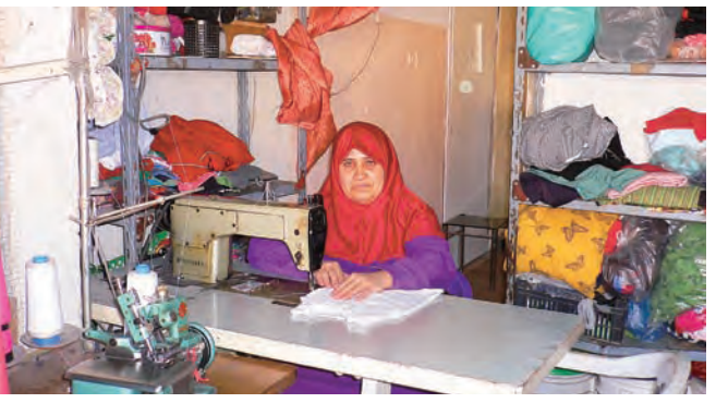
A graduate of WFWP training center opened a tailoring shop by a loan