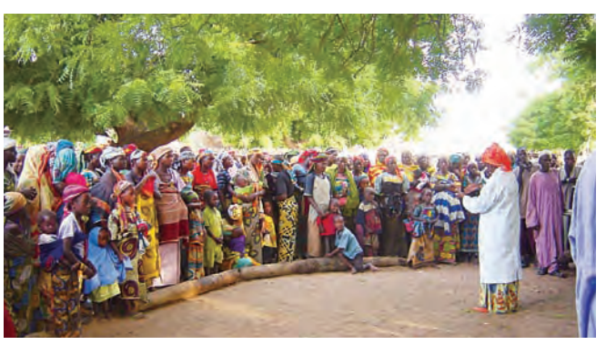
Hygienic instruction by a public health nurse at Kaba Dakuna Village