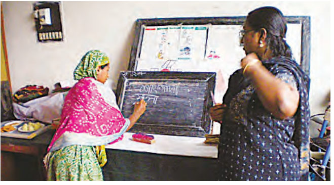
Mothers studying hard

Children are pleased with the gifts from Japanese supporters