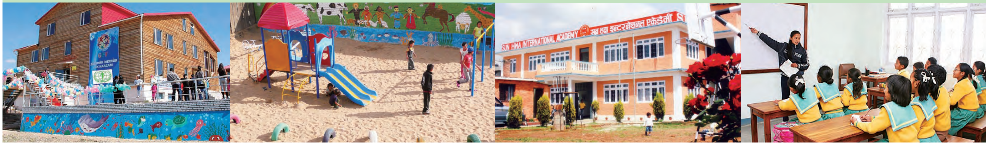
Renovated playground with play equipments