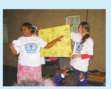
Nutrition guidance with a chart made by youth volunteers