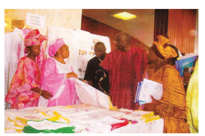
Minister of Education encouraged at Jamoo's booth of the exhibition