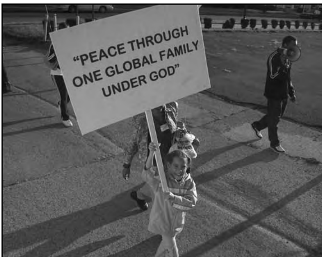
A girl carries a sign during a peace march on the International Day of Peace in Michigan, US.