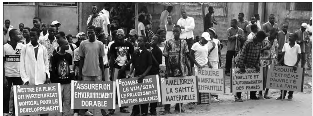
Posters raise awareness of the UN's Millennium Development Goals during the Global Peace Festival in Benin, Africa.

In recent years, democracy has begun to spread in Africa. Nigeria has enjoyed over eight years of uninterrupted civilian, democratic rule. Yet, religious and ethnic tensions continue throughout the continent, and growing disparity in economic structures between the haves and have-nots has heightened tensions between economic classes in Africa.