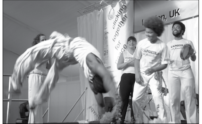
Capoeira, Brazilian martial arts dance