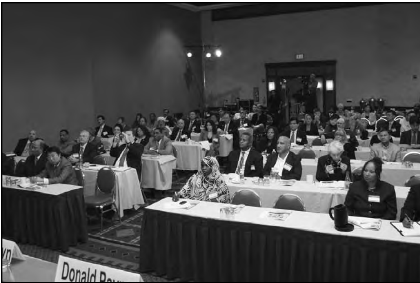
Audience at the US-UN Symposium