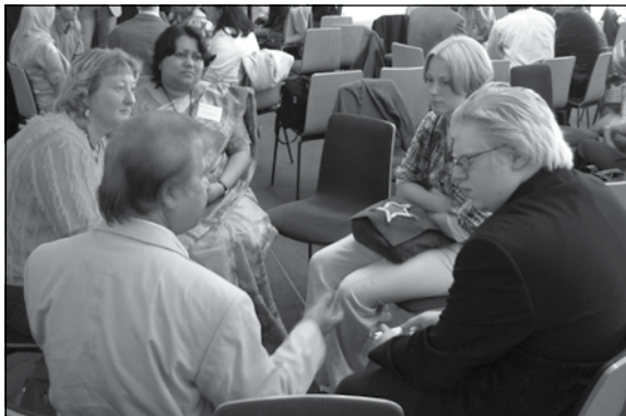
In discussion groups, participants explored ways to share their values.

The Sant Nirankari Mission, an all-embracing spiritual movement dedicated to human welfare, was one of eight partner organizations participating in the Global Peace Festival in London.