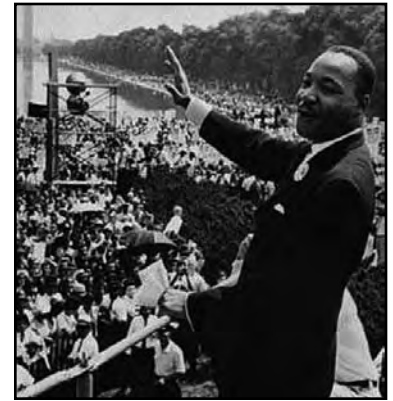
Dr. Martin Luther King, Jr.

Martin Luther King III is the eldest son of Dr. Martin Luther King, Jr., and Coretta Scott King. He is the founder and CEO of Realizing the Dream, Inc. This address was given at UPF's Assembly 2007, September 21-25, 2007, New York, New York.