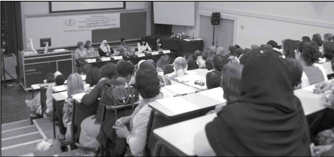
Conference on Gender Equality.