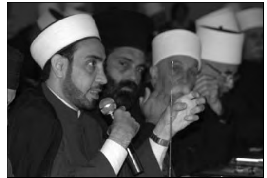
Many of the delegates were eager to ask questions and share their views.

Between sessions there were opportunities for discussion. Many of the delegates were eager to ask