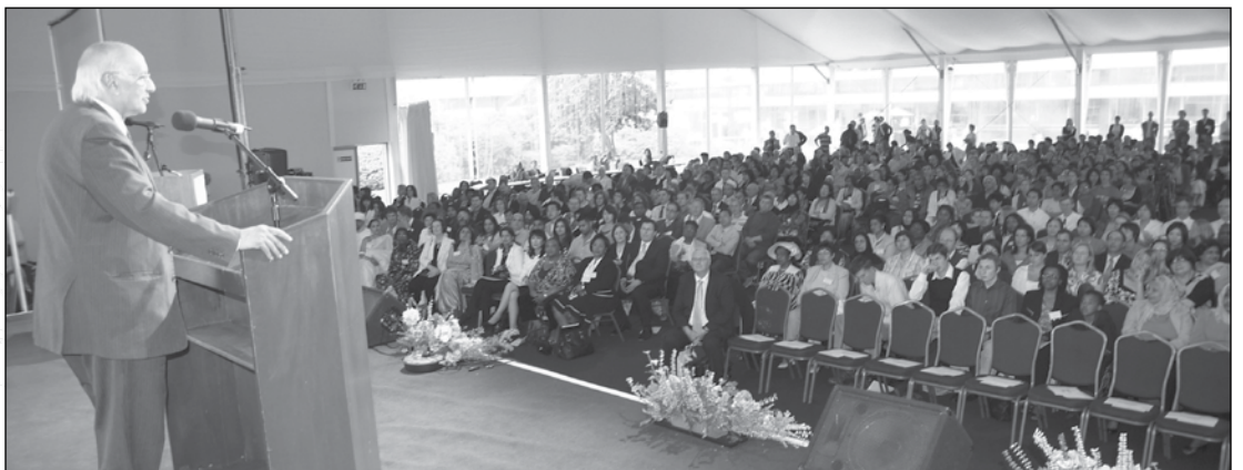
Lord Tarsem King