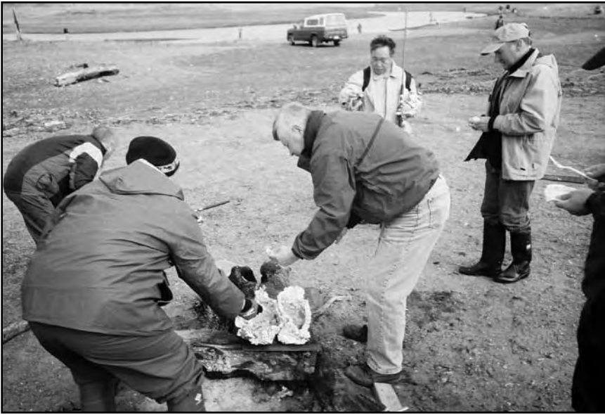
A few people caught some salmon, one of which we cooked fresh right out of the river, which made for a delicious lunch.