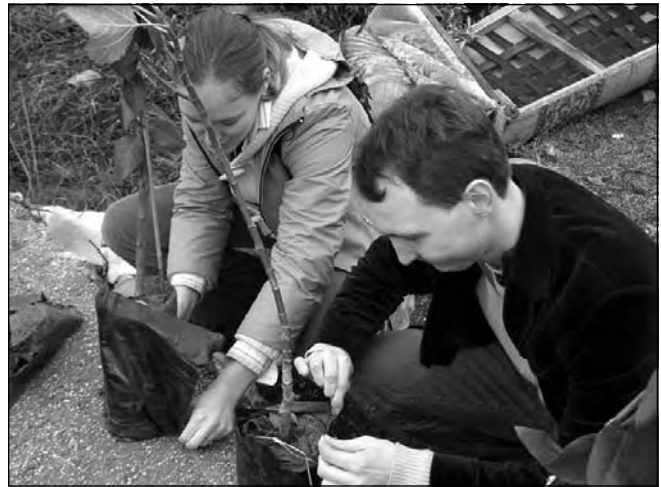
Israeli and Arab youth work together planting trees during a Global Peacemakers Project.