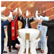
Peace Summit 2023