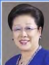
Hak Ja Han Moon Co-founder UPF