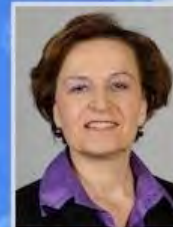
Anneli Jäätteenmäki Former Prime Minister of Finland