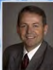
Lars Rise Former MP Norway