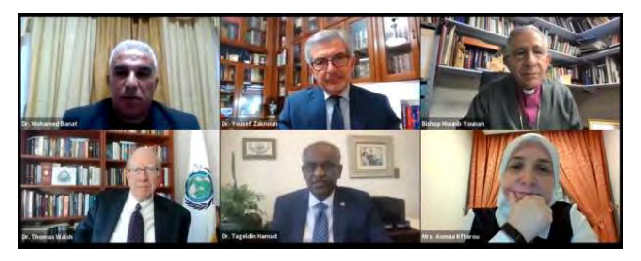
20210204 - Dialogue toward Peace, Harmony and Fraternity - English video from UPF Europe and Middle East on Vimeo.

New York, United States -- A UPF webinar commemorated two United Nations observances: World Interfaith Harmony Week and the first International Day of Human Fraternity. To watch the webinar in it's original audio, <u>click here</u>.