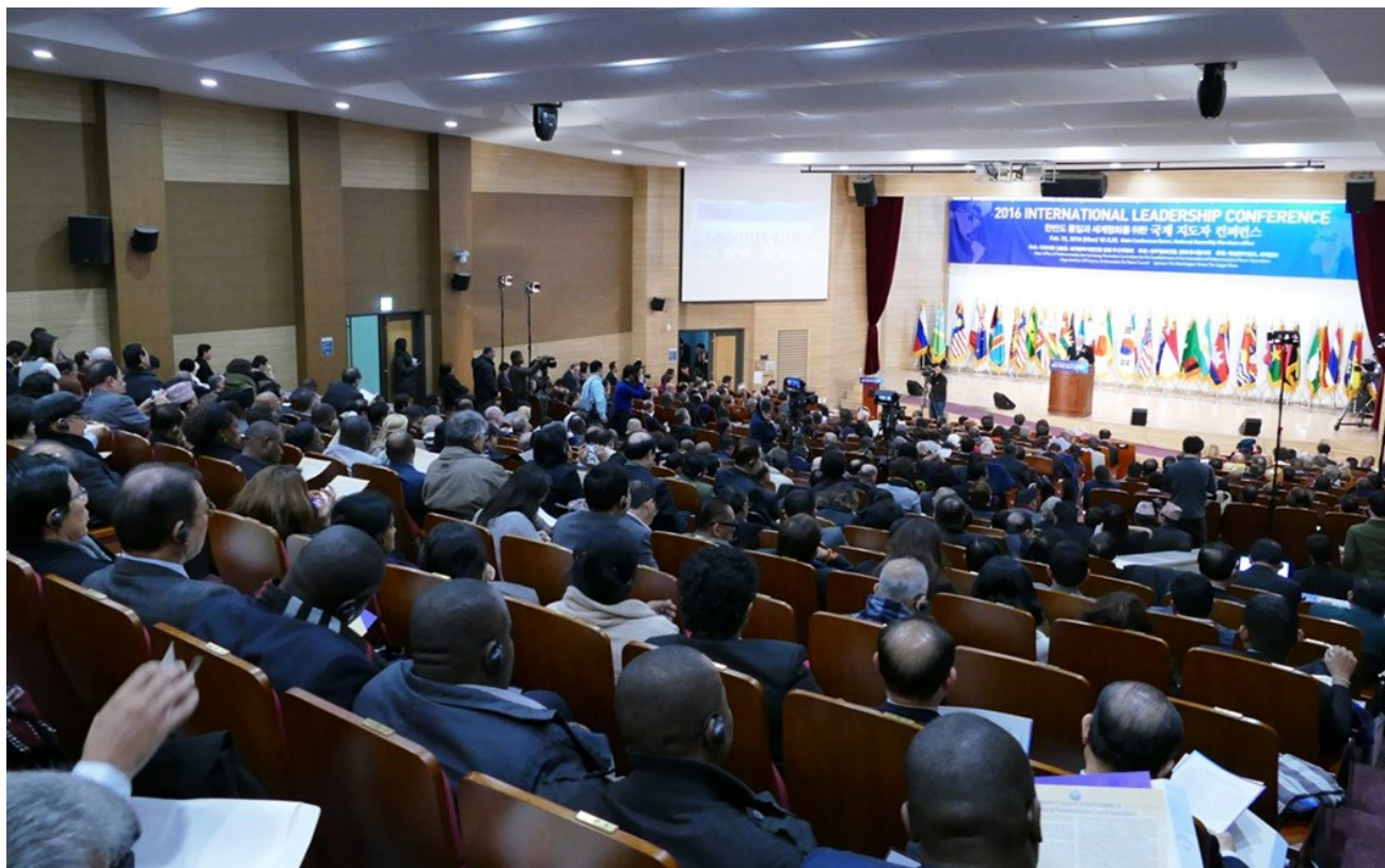
Resolution in Support of the Formation of International Association of Parliamentarians for Peace

The “International Association of Parliamentarians for Peace” has been launched as a worldwide association of parliamentarians which provides a forum to bring their experience and wisdom to bear in the search for solutions to our world’s problems. Parliamentarians from around the world have offered their remarks on the importance of their work and the value of increased cooperation and collaboration in the search for innovative solutions to some of the critical issues that we face on the local, national, regional and global levels, from climate change to the rise of extremist ideologies to humanitarian disasters and conflict.