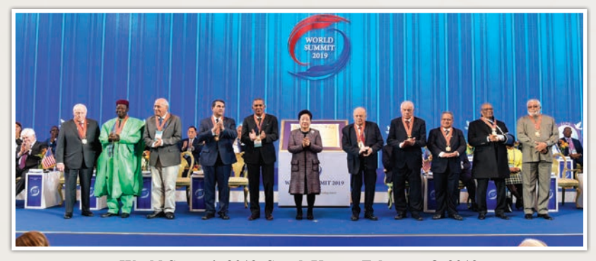
World Summit 2019. Seoul, Korea, February 8, 2019

International Leadership Conferences, symposia, and peace councils offer opportunities for capacity-building among leaders from all sectors. Peace and security considerations are complemented by "track two" diplomacy and grassroots programs that build support for a culture of peace.