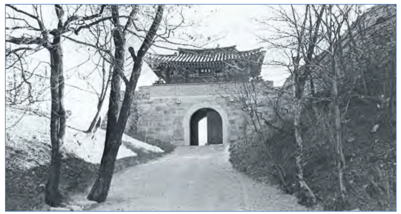
The ancient Moongyeong Gate, now preserved as a national historic site.