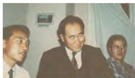
Members Welcome True Parents to Their Center in Canada November 29, 2017 In "Early Members Tell Their Stories"