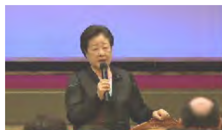
True Parent's Special Luncheon with CARP-USA July 14, 2018 In "News"