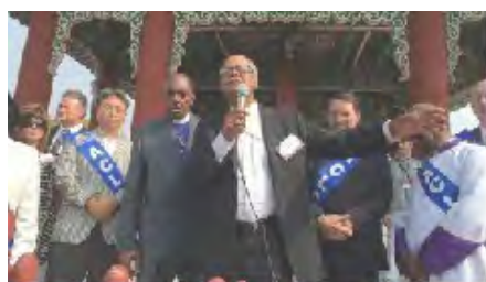
230 Ministers Pray for Peace at the DMZ September 9, 2017 In "News"