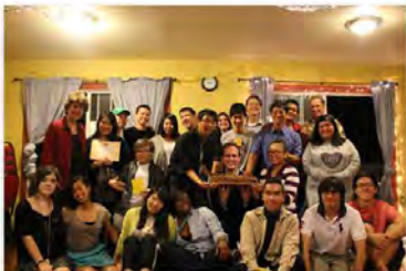
Shine City Project's 2nd Anniversary Celebration (March 14, 2015)