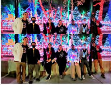
December 4, 2021 @ Opportunity Village - Magical Forest