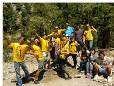
August 15, 2014 @ Mt. Charleston