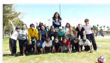
Shine City Project's 1st Anniversary (March 15, 2014 @ Sunset Park)