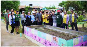
May 29, 2021 @ Vegas Roots Community