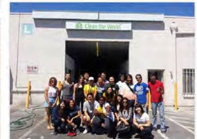
July 25, 2015 @ Clean the World