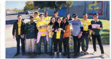
November 9, 2019 @ Just One Project - Helen Marie Smith Elementary School