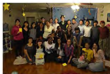
Shine City Project's 3rd Anniversary Celebration (March 18, 2016)