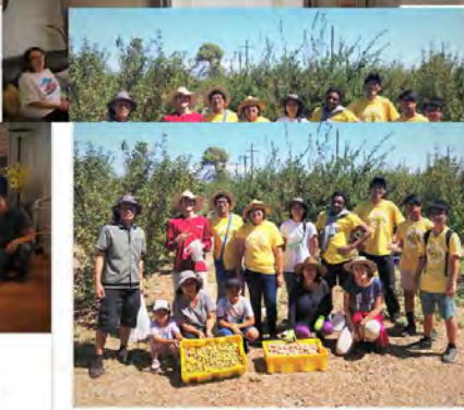
August 6, 2022 @ Ahern Orchard