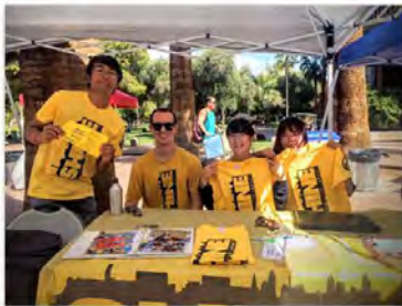
September 2, 2015 @ UNLV Involvement Fair