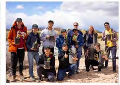
March 2, 2019 @ Las Vegas Wash