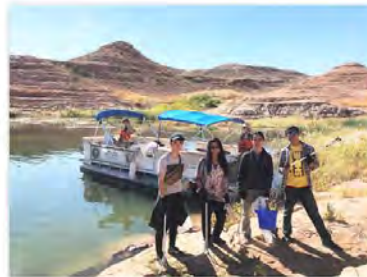
October 20, 2018 @ 33 Hole Overlook, Lake Mead