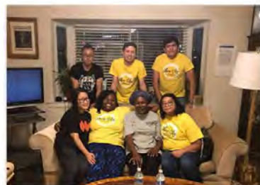
July 24, 2021 @ Harrison House