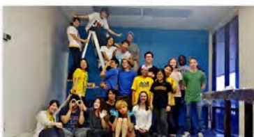
August 16, 2014 @ CARP Las Vegas Learning Center