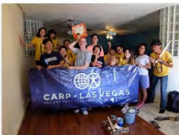
August 22, 2014 @ CARP Las Vegas House