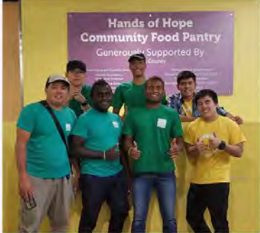
August 17, 2019 @ Catholic Charities of Southern Nevada with International Leadership Training Program (ILTP)