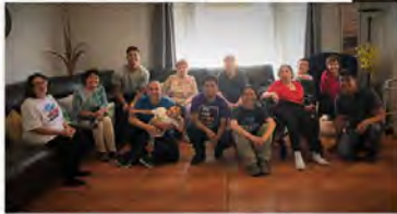
June 8, 2019 @ Silver Horizon Group Home