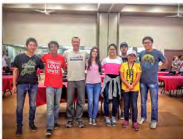
July 31, 2015 @ Las Vegas Rescue Mission