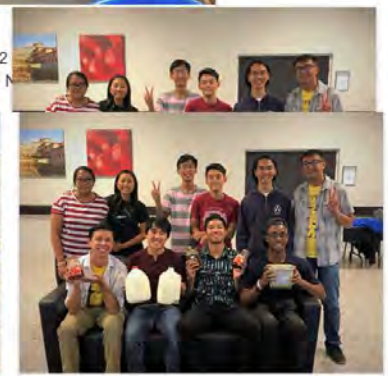
May 4, 2019 @ Club Christ Ladies Tea