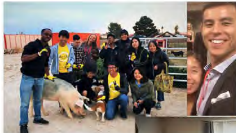
January 12, 2020 @ All Friend Sanctuary