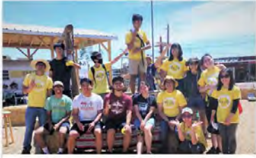
May 7, 2022 @ McKee Ranch Foundation