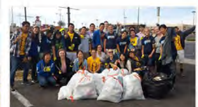
April 25, 2014 @ El Pollo Loco