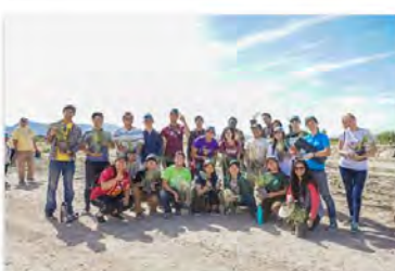
October 13, 2018 @ Las Vegas Wash with Generation Peace Academy