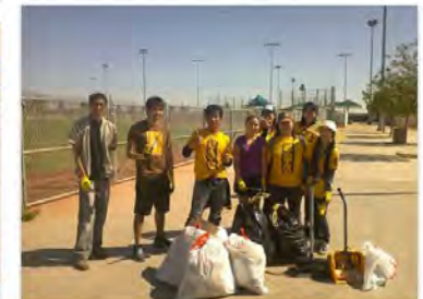
April 26, 2013 @ Lorenzi Park