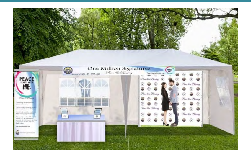
Starting August to December

Canopies will be set up at Flea Market events in Clifton and North Bergen