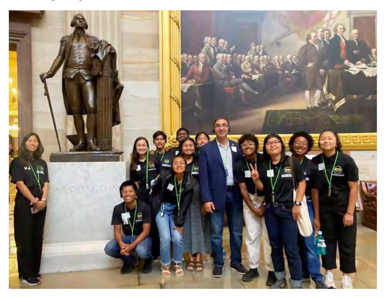
Elder Unificationist couples from the community happily opened their homes to host dinner each night,