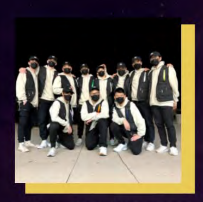
Rice Paddy Heroes 185227