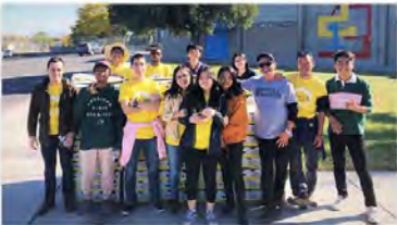
November 9, 2019 @ Just One Project - Helen Marie Smith Elementary School