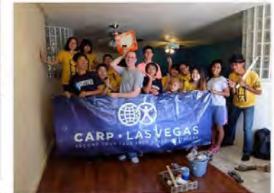
August 22, 2014 @ CARP Las Vegas House