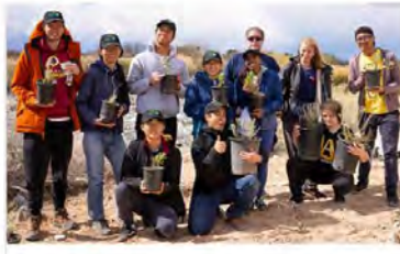
March 2, 2019 @ Las Vegas Wash