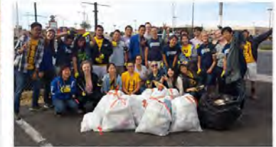
April 25, 2014 @ El Pollo Loco