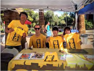
September 2, 2015 @ UNLV Involvement Fair