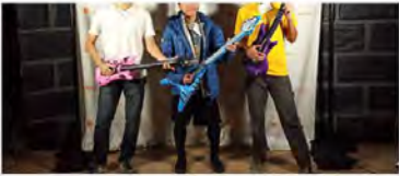
October 30, 2015 @ Haunted Harvest, Springs Preserve