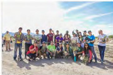
October 13, 2018 @ Las Vegas Wash with Generation Peace Academy