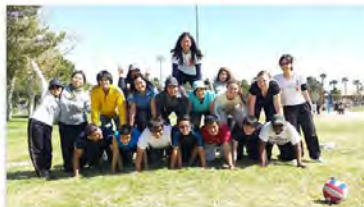
Shine City Project's 1st Anniversary (March 15, 2014 @ Sunset Park)