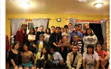
Shine City Project's 2nd Anniversary Celebration (March 14, 2015)