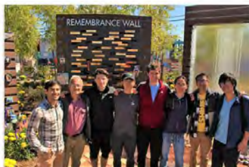
March 9, 2019 @ Las Vegas Community Healing Garden