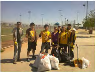
April 26, 2013 @ Lorenzi Park