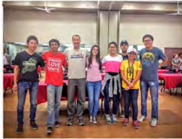
July 31, 2015 @ Las Vegas Rescue Mission