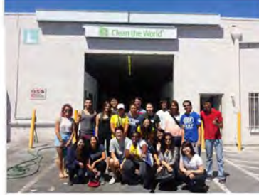
July 25, 2015 @ Clean the World