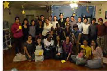
Shine City Project's 3rd Anniversary Celebration (March 18, 2016)