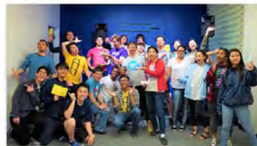
Shine City Project's 6th Anniversary Celebration (March 16, 2019 @ CARP Las Vegas Learning Center)