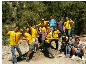
August 15, 2014 @ Mt. Charleston