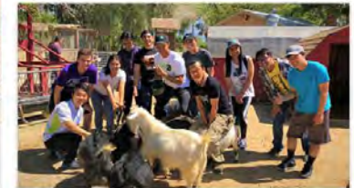
April 20, 2019 @ Gilcrease Nature Sanctuary