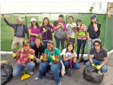
Our First Service Project (March 16, 2013 @ World's Largest Gift Shop)