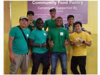
August 17, 2019 @ Catholic Charities of Southern Nevada with International Leadership Training Program (ILTP)