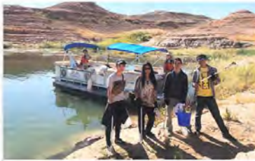
October 20, 2018 @ 33 Hole Overlook, Lake Mead