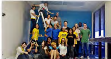
August 16, 2014 @ CARP Las Vegas Learning Center