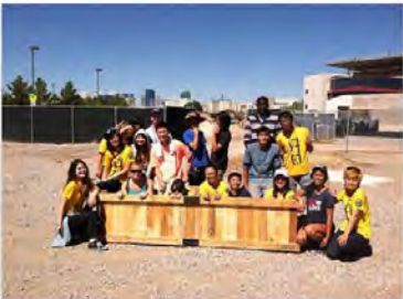
August 9, 2014 @ Rebel Recycling Center