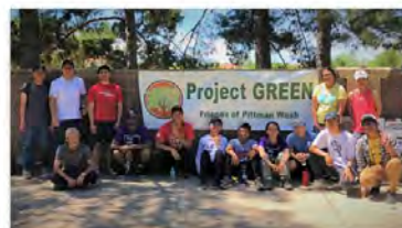
April 27, 2019 @ Pittman Wash