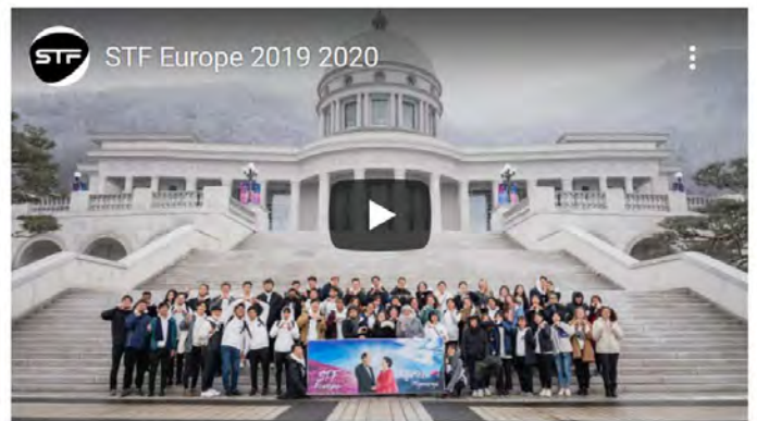
A video highlighting the year of 2019/2020