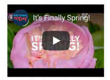
It's Finally Spring!