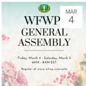
WFPW General Assembly & Special Educational Sessions Mar 4, 2022 – Mar 5, 2022