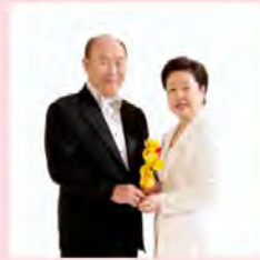
What Inspires Me About Our Founders Feb 24, 2022