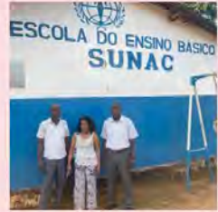
WFPW Maine Chapter Takes Initiative to Support School in Guinea-Bissau Feb 24, 2022