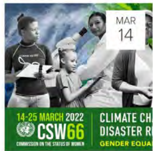
Virtual CSW66 & CSW66 NGO Forum Mar 14, 2022 – Mar 25, 2022