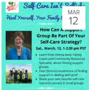
Self-Care Isn't Selfish: Heal Yourself, Your Family & the World Mar 12, 2022