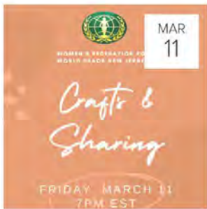
Crafts & Sharing Mar 11, 2022