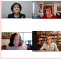
Women Leaders' Leverage on Peacebuilding: Toward a Peaceful Reunification of the Korean Peninsula Feb 24, 2022