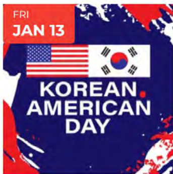
Korean American Day