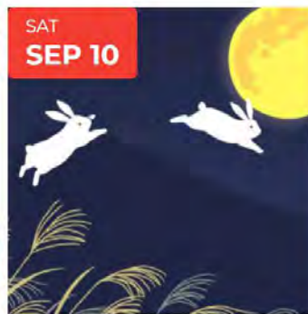
Harvest Moon Festival