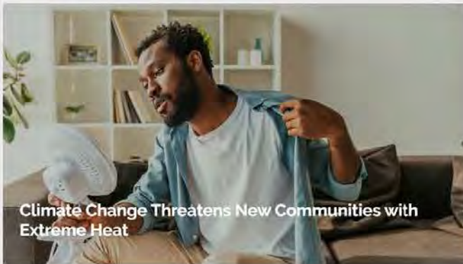
Climate Change Threatens New Communities with Extreme Heat