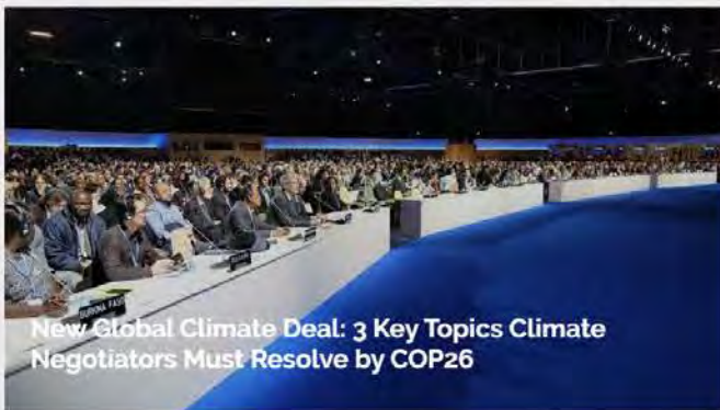
New Global Climate Deal: 3 Key Topics Climate Negotiators Must Resolve by COP26