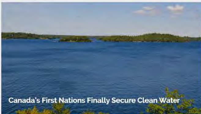
Canada's First Nations Finally Secure Clean Water