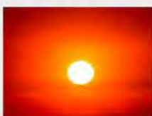
Extreme Heat Causes Hottest July on Record