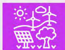
Latest Information on Renewable Energy in Europe