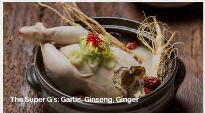
The Super G's: Gartie, Ginseng, Ginger