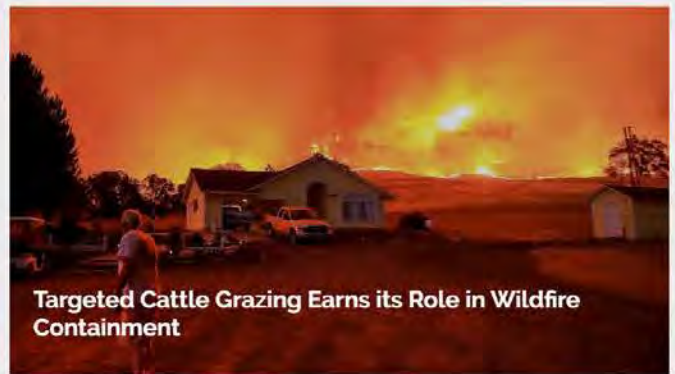
Targeted Cattle Grazing Earns its Role in Wildfire Containment