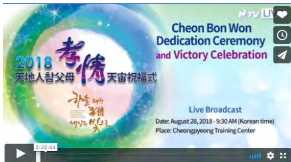
2018 – 180828 – Cheon Bon Won Dedication Ceremony and Victory Celebration

The first 15 minutes of the video below is the Opening and Dedication Ceremony of the new Genealogy Centre: