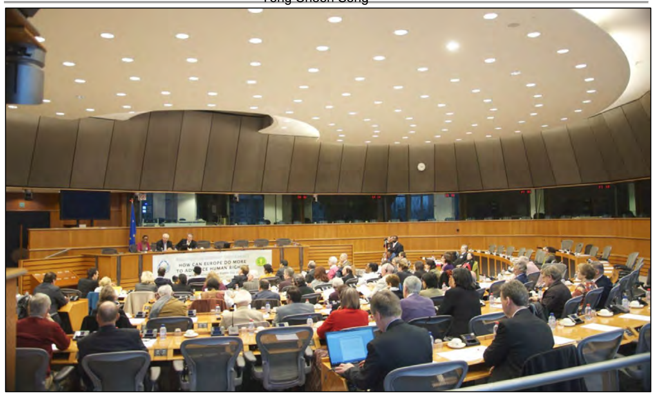
European Parliament, where the final 2 sessions of the conference were to take place