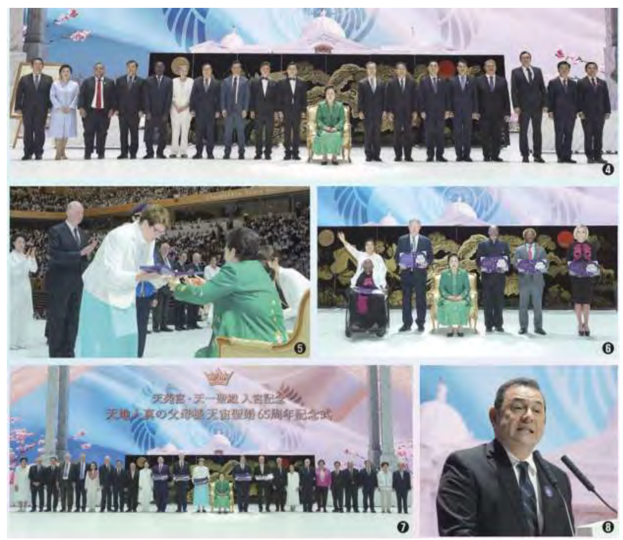
4 Offering of Gifts from each Continental Region 5 Special Awards for Meritorious Individuals 8 Former President of Guatemala Jimmy Morales Giving His Congratulatory Address