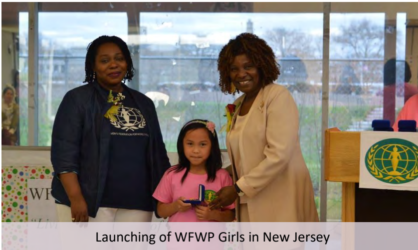
Launching of WFWP Girls in New Jersey