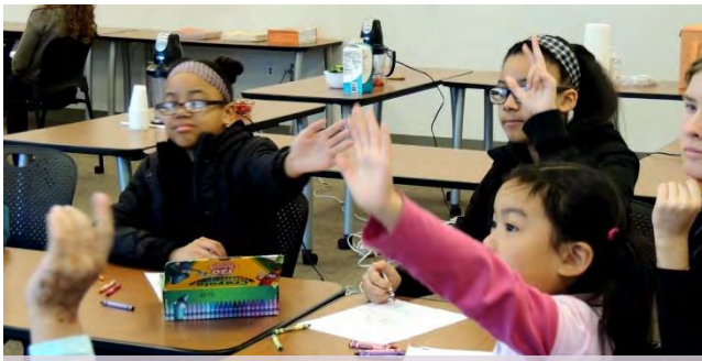
Interactive nutrition seminar in Bridgeport