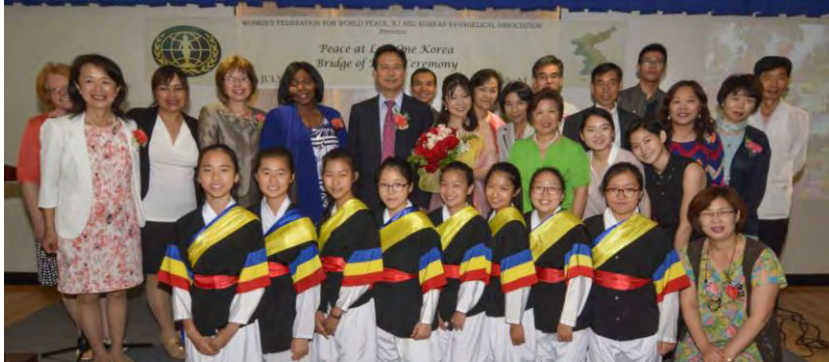
Peace at Last One Korea, Bridge of Peace in New Jersey, 2015