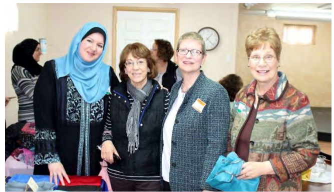
25 th Anniversary and Networking Fair in Colorado