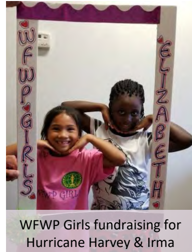
WFWP Girls fundraising for Hurricane Harvey & Irma