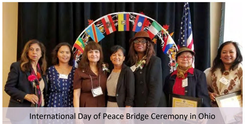
International Day of Peace Bridge Ceremony in Ohio