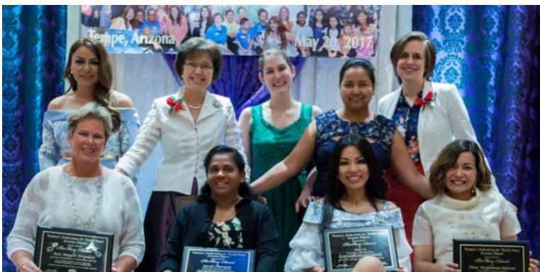
Global Women's Peace Network 25 th Anniversary in Arizona

Commemorate the year with us by watching the WFWP International video shared at their Anniversary Celebration here: https://vimeo.com/238656821