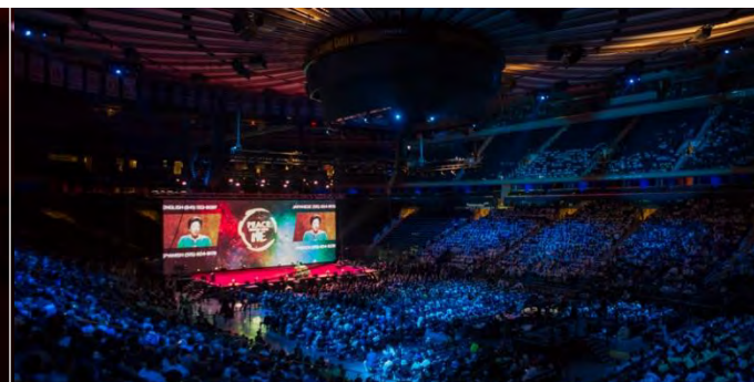
Dr. Hak Ja Han Moon speaks on “Peace Starts With Me” at Madison Square Garden, July 15, 2017