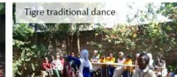
WFWP One Hope Garden Primary School in Ethiopia