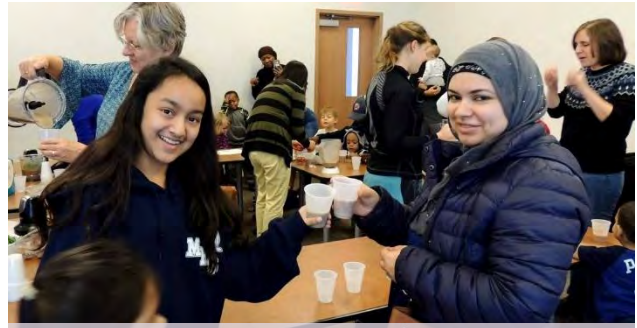
Making green monster smoothies