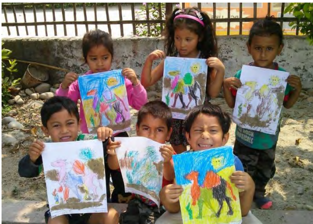
Building a safe, loving kindergarten in Nepal

These results provide education in nine schools in eight African countries, the building of a kindergarten in Nepal, and provide one year of education, books, and school meals for 66 students in Cambodia, and more!