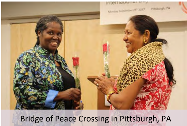
Bridge of Peace Crossing in Pittsburgh, PA