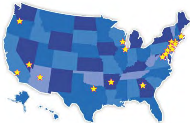
Chapters visited by WFWP USA Headquarters