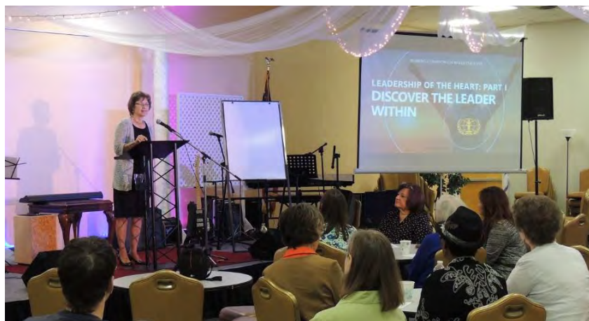
Launching of Leadership of the Heart Curriculum in Maryland