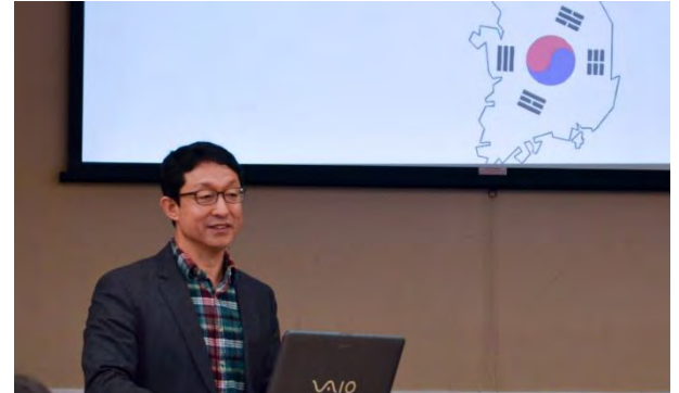
2017 sharing the importance of a united Korea