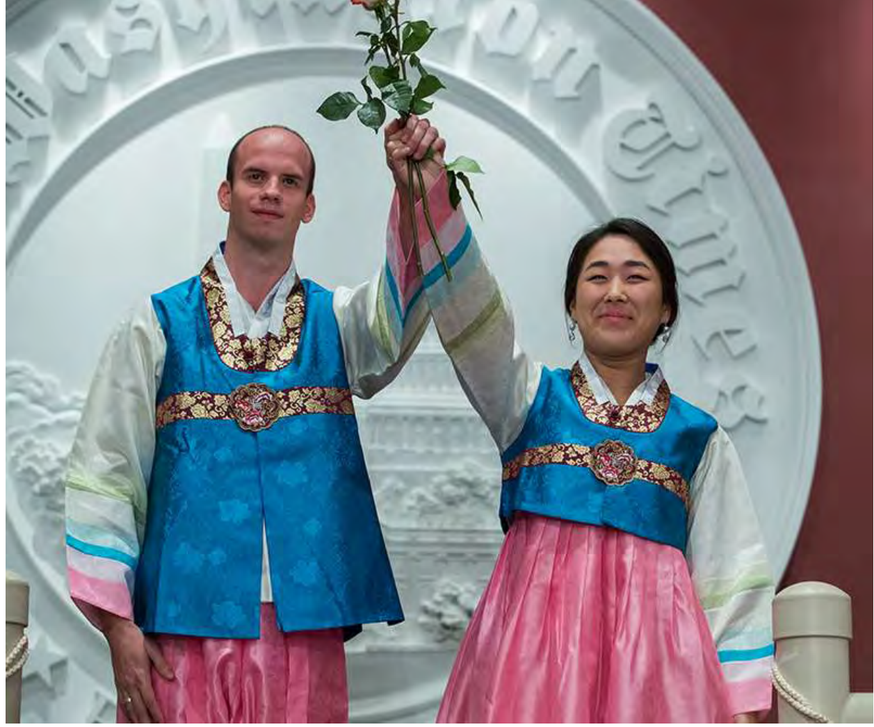
Tears flowed and then faces began to smile as each pair crossed the Bridge. After all the pairs crossed, everyone sang together, "Let There Be Peace on Earth," and took a group photo on the Bridge. As one participant noted, "Today history was made in America for a change for the better. Something came to a closure and something new was given birth to."