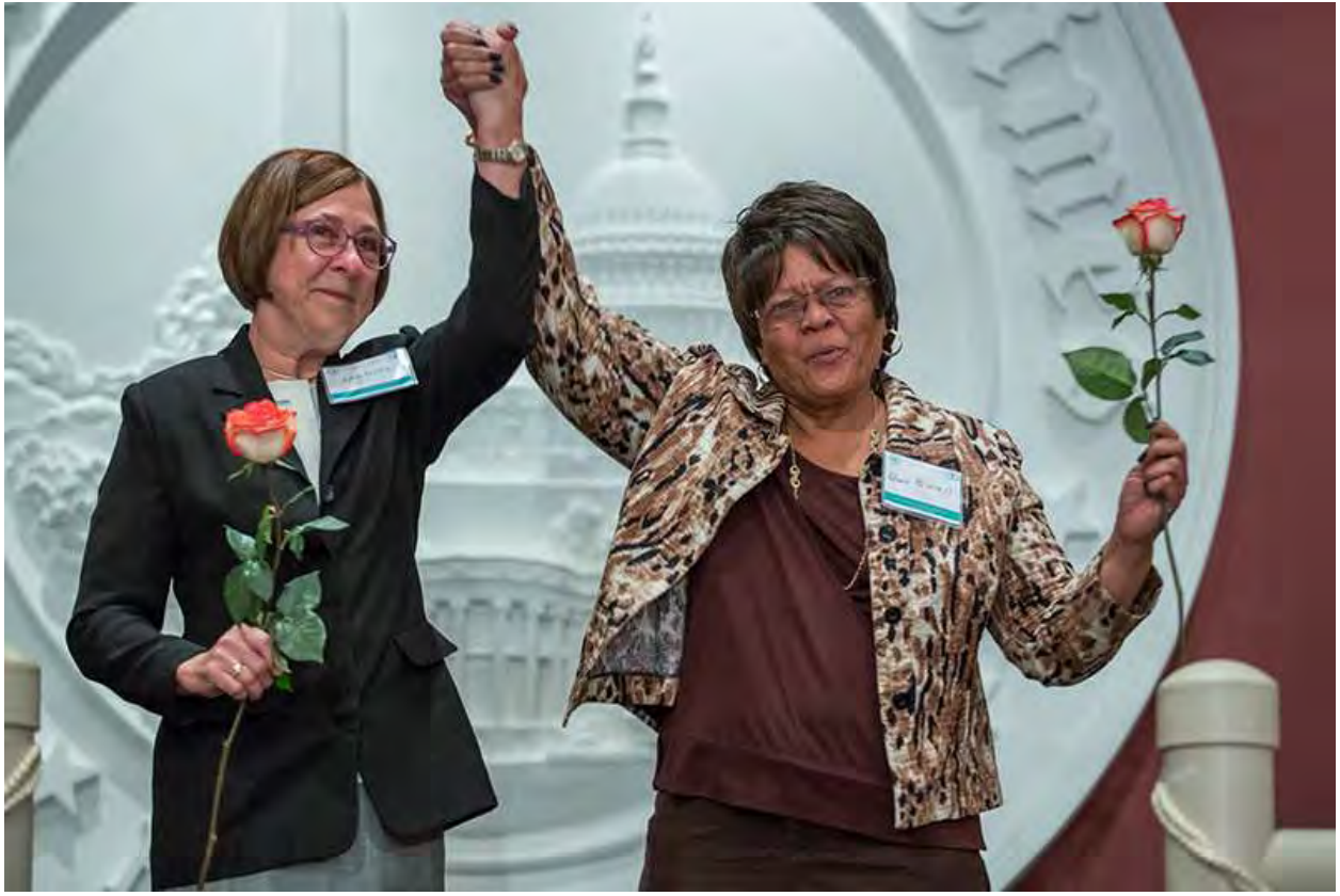
6. Interracial Couple – Creating World Peace through International and Interracial Marriages