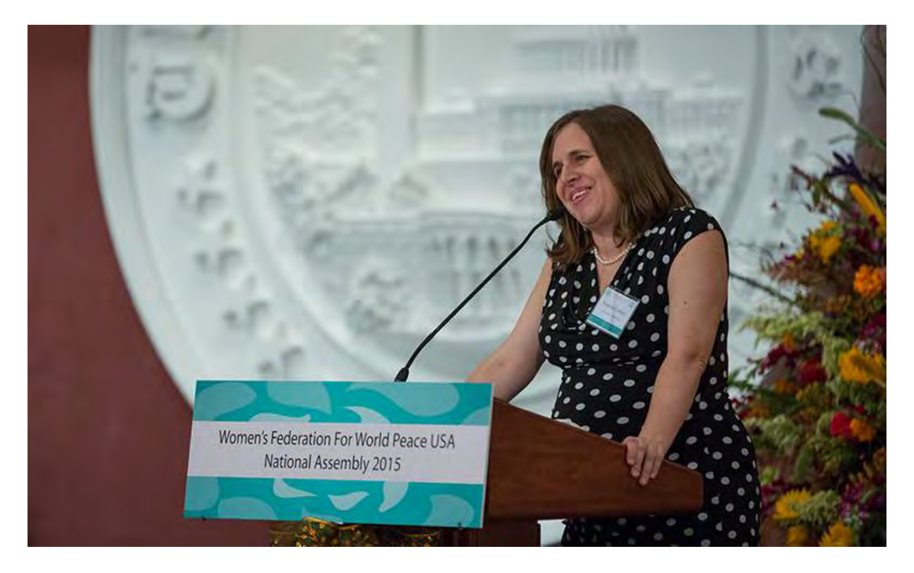
Our emcee then announced a raffle and redirected the audience to the availability of mocktails on a side table, along with deliciously prepared and very colorful hors d'oeuvres to munch on as the Networking Fair continued.