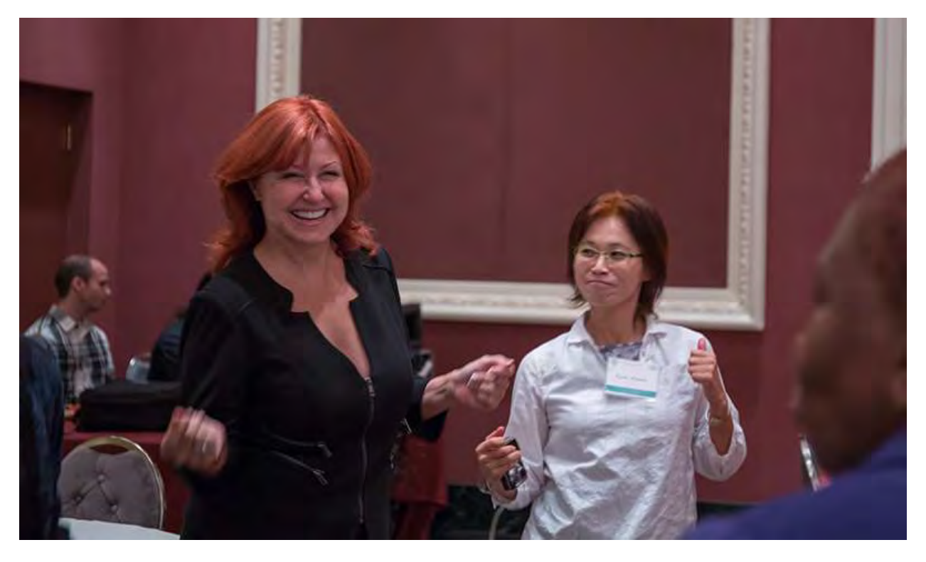
We thank our God in heaven and most of all our True Parents, who have shown us through their example how to live for the sake of others. They have laid the foundation for this precious organization and are now counting on us to carry on their legacy of true love in action. It was an assembly to remember!