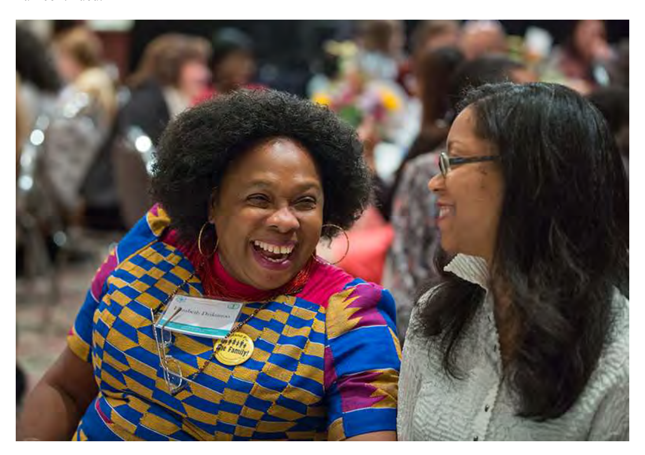
Main Event Saturday, October 24