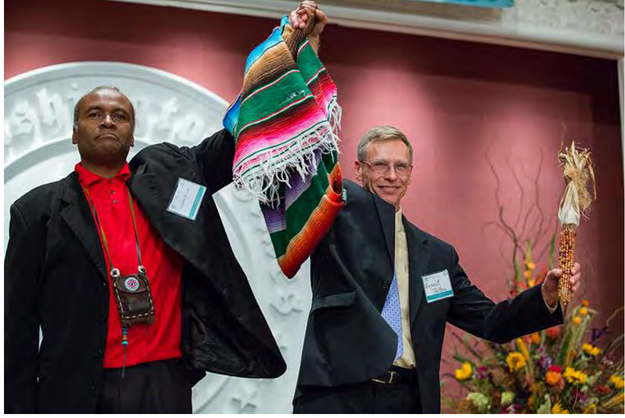
4. Democrat and Republican – Democratic and Republican Cooperation