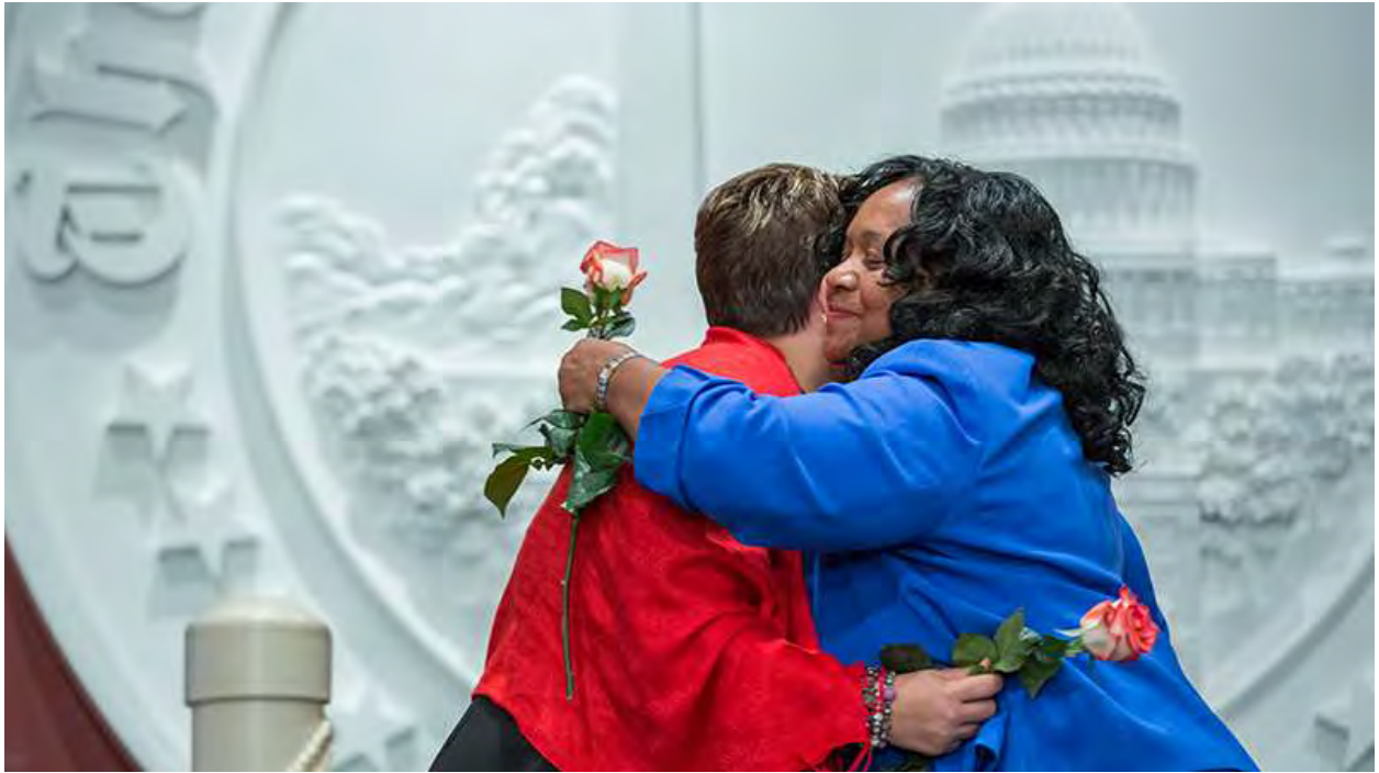
5. Black and White – To Build Black and White Unity