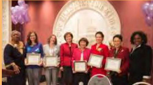
Schools of Africa benefit award recipients

Since 2000, WFWP, as a United Nations NGO, has sought to contribute through its activities to the UN Millennium Development Goals (MDGs).