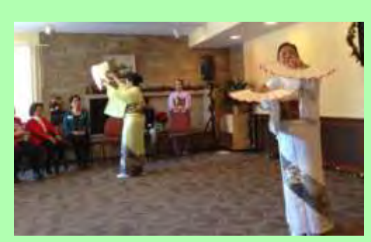
Japanese dance to Sakura music