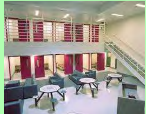
Inside the Juvenile Detention Facility

It was a most suitable day to remind the girls to have a dream and to hold on to it - a good dream, a dream of love. I wrote on the board two acronyms for love: Love Overcomes Victoriously Everything, and Live On Values Eternally. Also, I encouraged them to discover what they are good at, such as writing, playing music, working in the medical field, etc. It is good for us to be creative and productive.