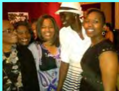
WFWP at Apollo Theater