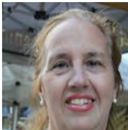
Hon. Gale A. Brewer