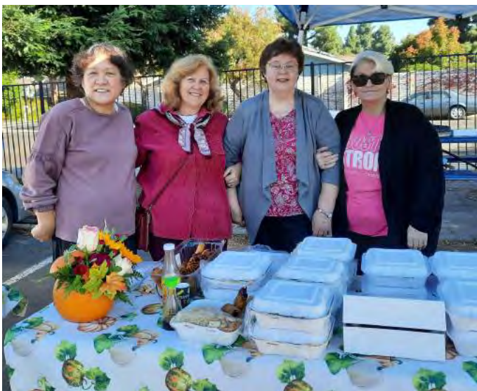
Benefit for Schools of Africa in Northern California

Each year, local chapters and members across the USA organize innovative and engaging events to raise funds for the Schools of Africa Project with ten schools throughout eight African countries. These funds have helped to continually maintain the schools, finance school supplies, improve buildings and classrooms, secure funds for scholarships to low-income students, and much more.