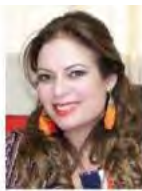
Hon. Mdm. María Fernanda Flores de Alemán First Lady, Nicaragua (1997-2002) Congresswoman (2012-2020)