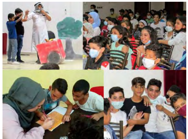
Providing a brighter future to refugee children in Jordan