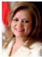
Hon. Mdm. Emilia Alfaro de Franco First Lady, Paraguay (2012-2015) Senator (2015-2018)