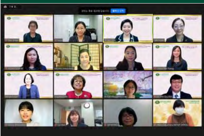
GWPN peace building forum