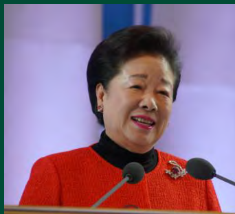
WFWP Founder, Dr. Hak Ja Han Moon