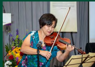
Playing for peace

“You can feel empowered from within, when you feel you are of value and you can contribute. I felt there was that give and take energy; people felt empowered, they felt that our opinions matter, and I’m contributing to something bigger. We know that change can start on a small scale and reach out.” - WFWP USA friend