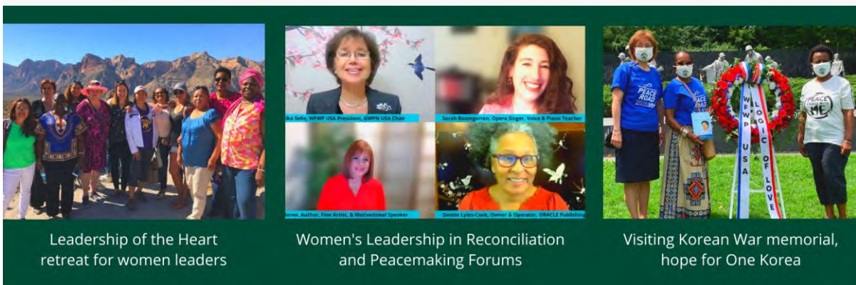
Leadership of the Heart retreat for women leaders

Did you know? WFWP USA service projects, charitable grants, peace leadership, and educational programs are the cornerstones for our vision of a unified world, based on the Culture of Heart. Together we can care for our communities and provide hope.