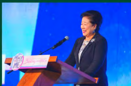
WFWP Founder, Dr. Hak Ja Han Moon