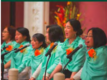
Singing for the hope for peace

“Thank you for sharing about the character God gave to we women, to care for, invest in, and embrace others wherever we are. Congratulations to the founders of WFWP for making a difference for good in our families and world!” -a WFWP USA fan