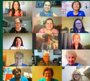
WFWP Anniversary Gathering

May God Bless you and your family, and may the love of mothers and fathers shine for everyone this season!