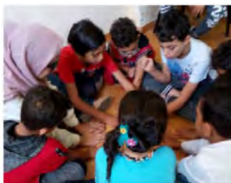
"When a child gains basics education, they keep hope in their future..... we have seen

WFP Jordan is running literacy classes at the WFP and Community Development Centers (CDC) located in the refugee camps. Especially in 2020, the center has been able to stay open because public schools have been closed for over a year due to the pandemic. The WFP center is one of the few places where they can study in the area.