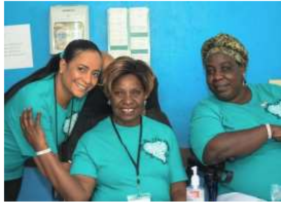
Partnership with Stand Up to Poverty

WFWP works for sustainable peace, through our Leadership of the Heart education, through our Cornerstone for Happiness relationship education, and by networking with like-minded organizations to strengthen our impact.