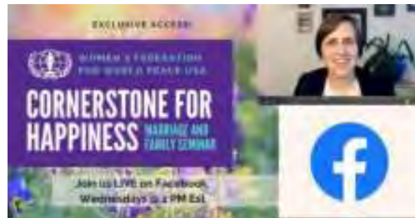
Transformative marriage seminar on Facebook Live