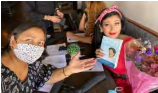
Our founder Dr. Hak Ja Han Moon's memoir

Will you lend your support to keep this mission going for greater peace in 2021?