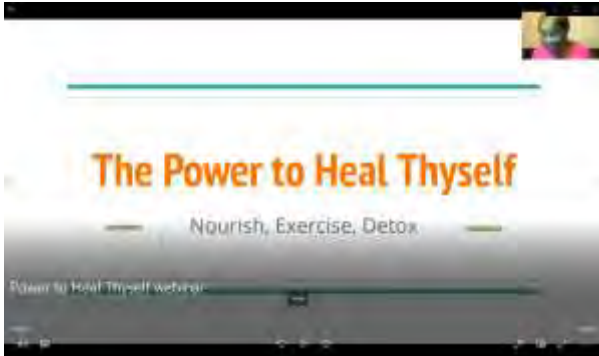
Exciting health and healing webinar

Yes! I want to create a Culture of Heart!