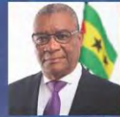
Evaristo Carvalho President of São Tomé