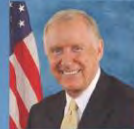
Dan Burton US Congressman