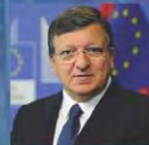
José Manuel Barroso Former President of the European Commission