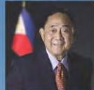
Jose de Venecia Jr. Speaker of the Philippine House of Representatives