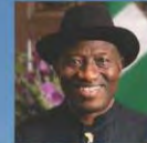
Goodluck Jonathan President of Nigeria