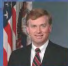
Dan Quayle Former US Vice President