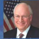
Richard Cheney Former US Vice President