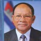
Heng Samrin President of the National Assembly of Cambodia