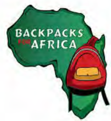
Backpacks for Africa