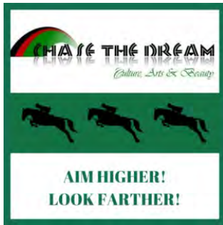
Chase the Dream Culture, Arts & Beauty