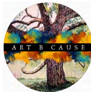
Art B Cause