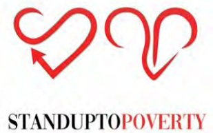
Stand Up To Poverty

Showcase Your Organization By Becoming a Global Friend