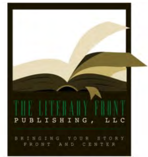
The Literary Front