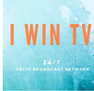
I WIN TV- Faith Broadcast Network