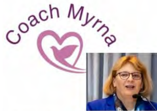
Guiding and supporting parents along the path of raising kids to be happy and responsible.