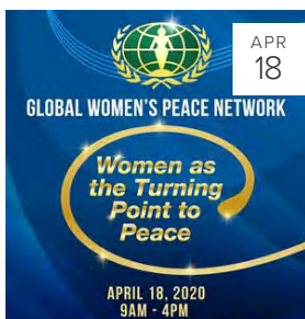
Global Women's Peace Network Conference in Phoenix, Arizona Apr 18, 2020