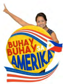
Buhay Buhay Sa Amerika