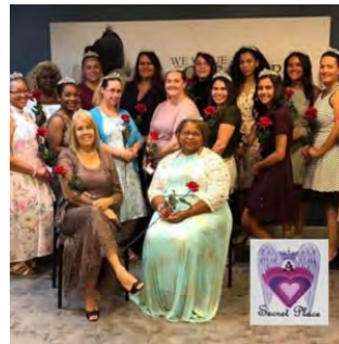
A Secret Place Ministries