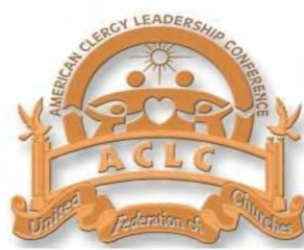
ACLIC Women In Ministry