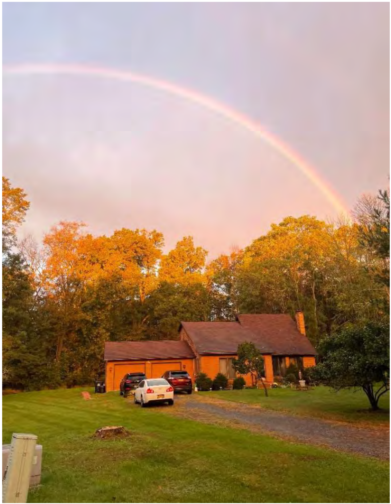
Our house wrapped in a rainbow

Joy is to be found and elevated to a new world where God lives. The knowledge of God is the greatest knowledge of all. God's creation, all of nature, teaches us so much about how to live harmoniously with God and with each other.