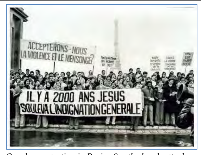
Our demonstration in Paris after the bomb attack

After spending a short time with my parents and in Camberg (our German training center) I was assigned with many others to go to France. I stayed in Lyon, where we started to do mission work. At that time there was a lot of persecution. There was so much hostility towards us. It culminated in one of our centers in Paris (Villa Aublet) being bombed. One sister was seriously injured. It was such a shock.