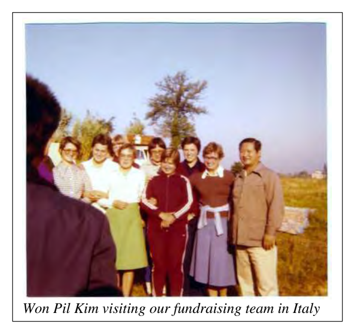
My mission for the next two years was fundraising in several European countries, mostly in France, Italy, Belgium and Holland.

A few months later, while fundraising in France, I could feel how the spirit was much more relaxed and peaceful. The period of this intense persecution seemed to have passed.