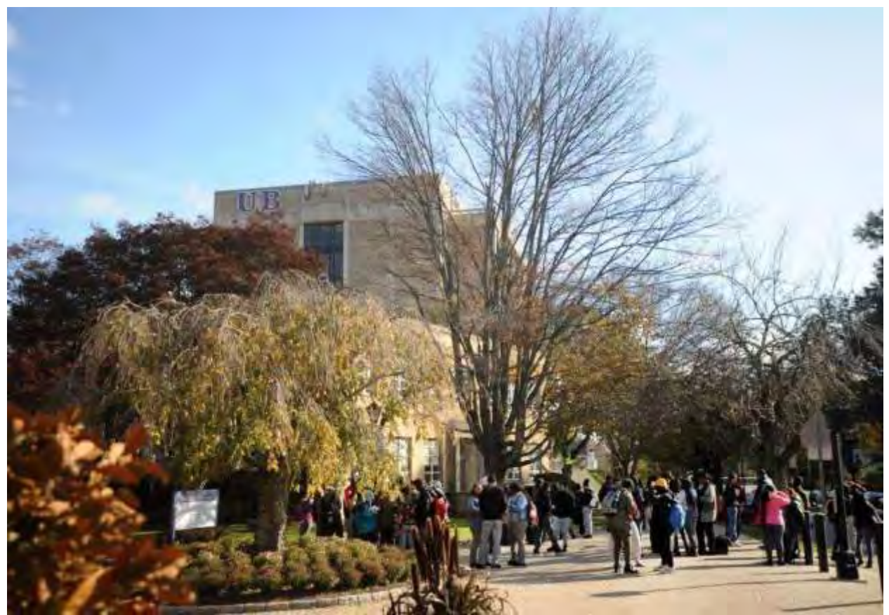
The University of Bridgeport campus in Bridgeport, Connecticut