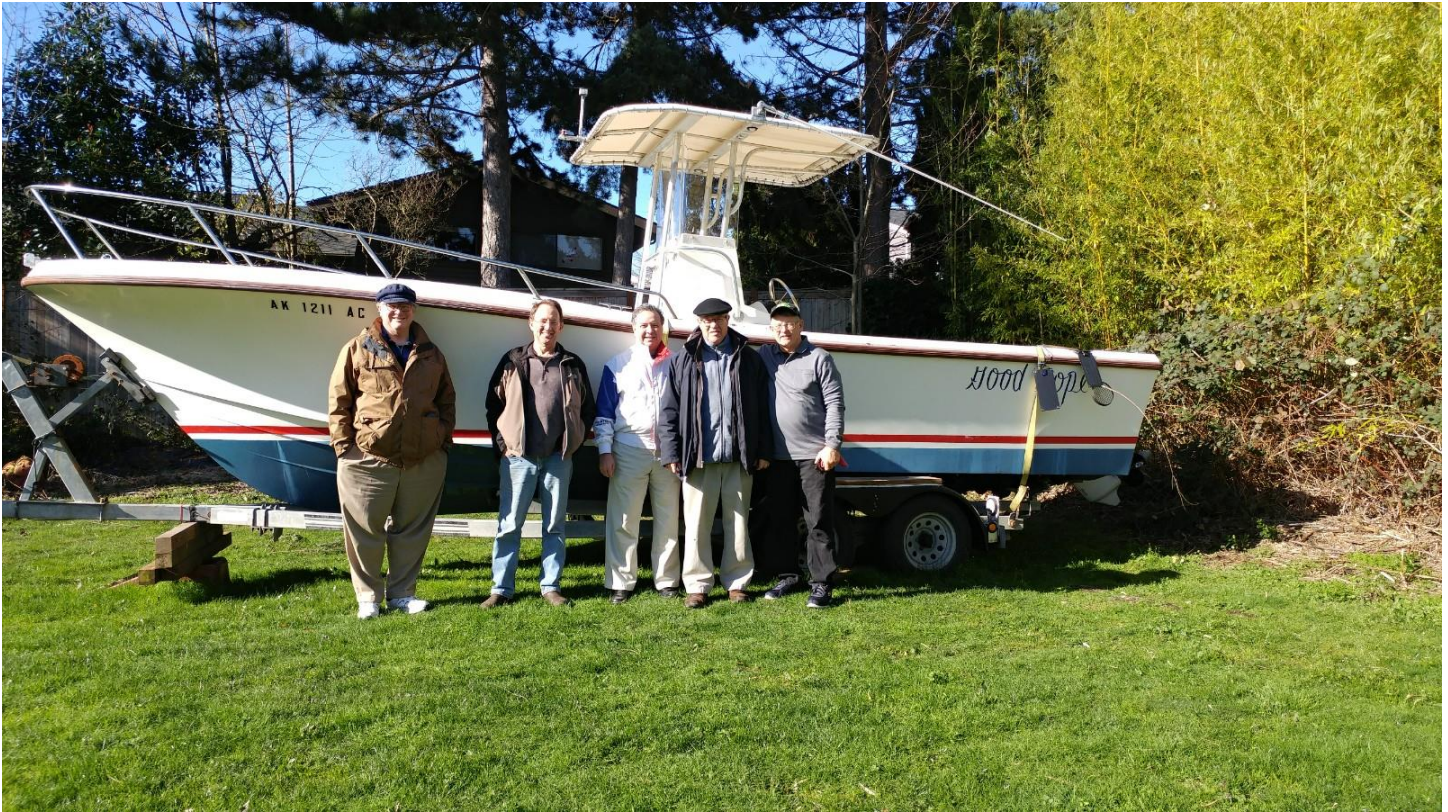
Old Salts looking forward to provide Seattle families time on the water with True Parents lineage of strong safety, fun and inspiration far into the future.