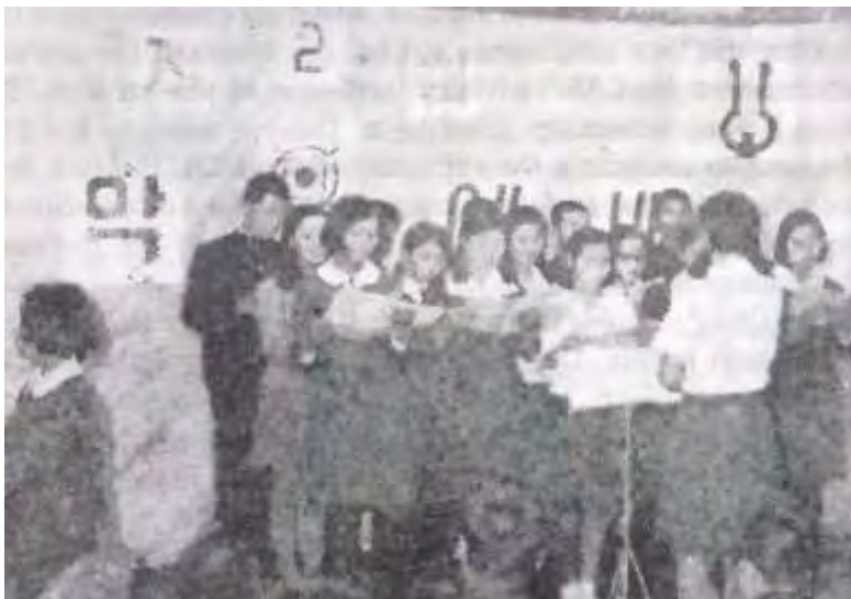
Special Wednesday evening service for middle and high school students

They meet in the student hall on Saturday afternoon and come to the church very often. The women leaders for the girl members and men leaders for the boy members are usually in their mid-twenties. They try to meet the school children as possible in order to guide them and create better relationships.