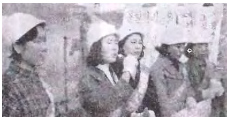
"What is the Divine Principle?"

Apart from individual targets they may have set to earn money for the new building, they have, as a team, a goal of bringing in twelve new members by the time that our Leader returns to Korea.