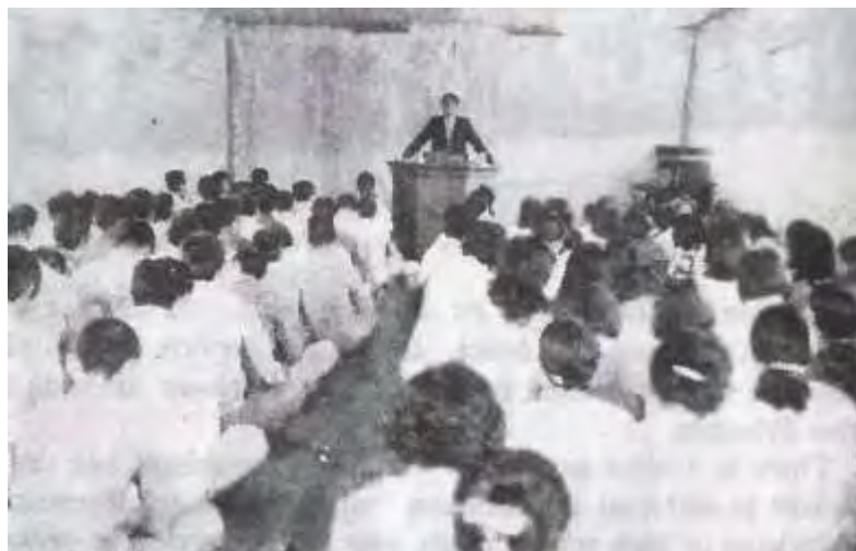
"Let us Emulate the Forgiveness Shown to Us by the Messiah."