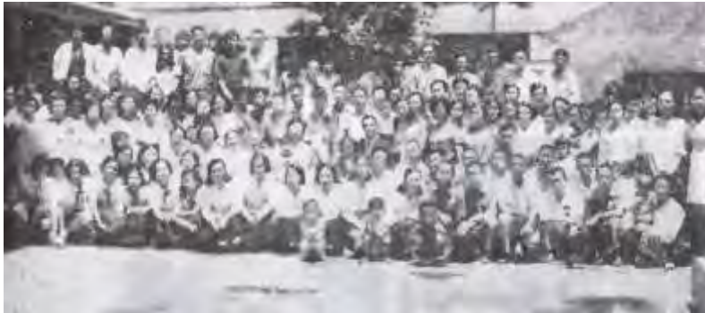
Some of the members after the Sunday Service, June 10th 1973

If we thoroughly forgive our persecutors they will come to fear us. Thus only with hearts of forgiveness can we approach our persecutors. Let us learn a lesson from Jesus.