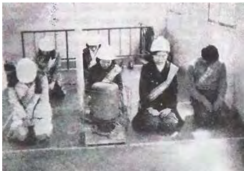
On a winter's day, some Kidongdae members prepare for work

Kidongdae is a Korean term used to describe an army or other unit that has been specially trained and is ready for action at any time.