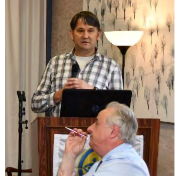
Presenting ideas for the Centennial celebration of True Father for CARP, WFWP, Frankfurt Bookfair