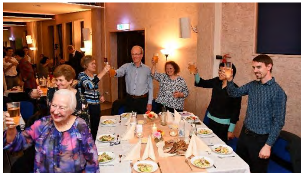
Cheers!!! All enjoying a marvelous banquet!