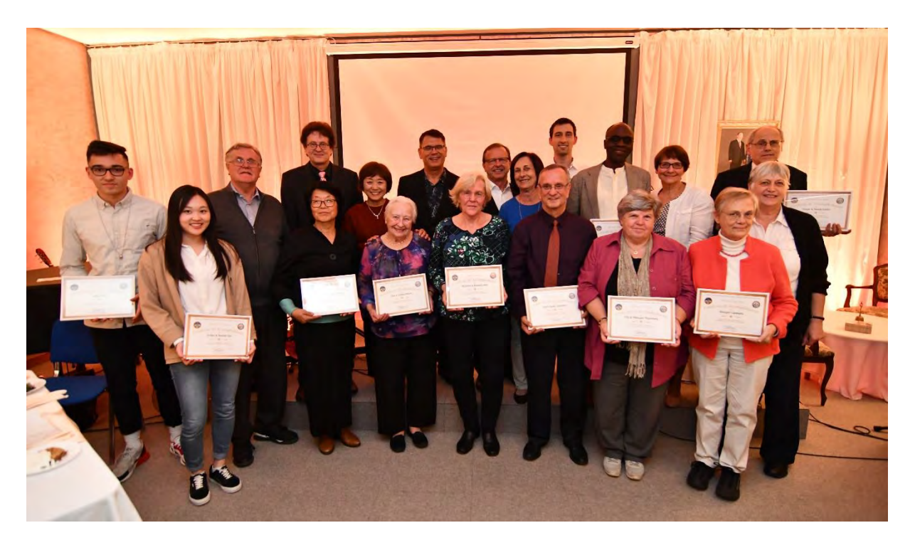
Certificates of accomplishment for the blessing of 430 couples