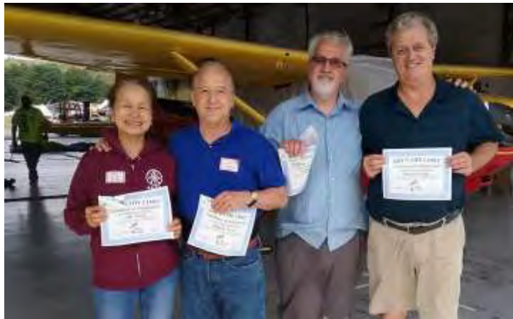
At Sky's the Limit in Stroudsburg, PA

Then he asked for testimonies from brothers and sisters about going sky-diving.