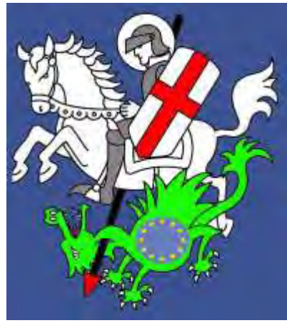
St. George Kills the (EU) Dragon

It was in fact totally a miracle and the working of Heavenly father.